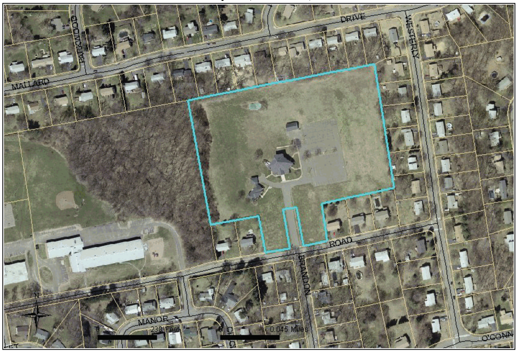
See page 2 for Legend and Disclaimer