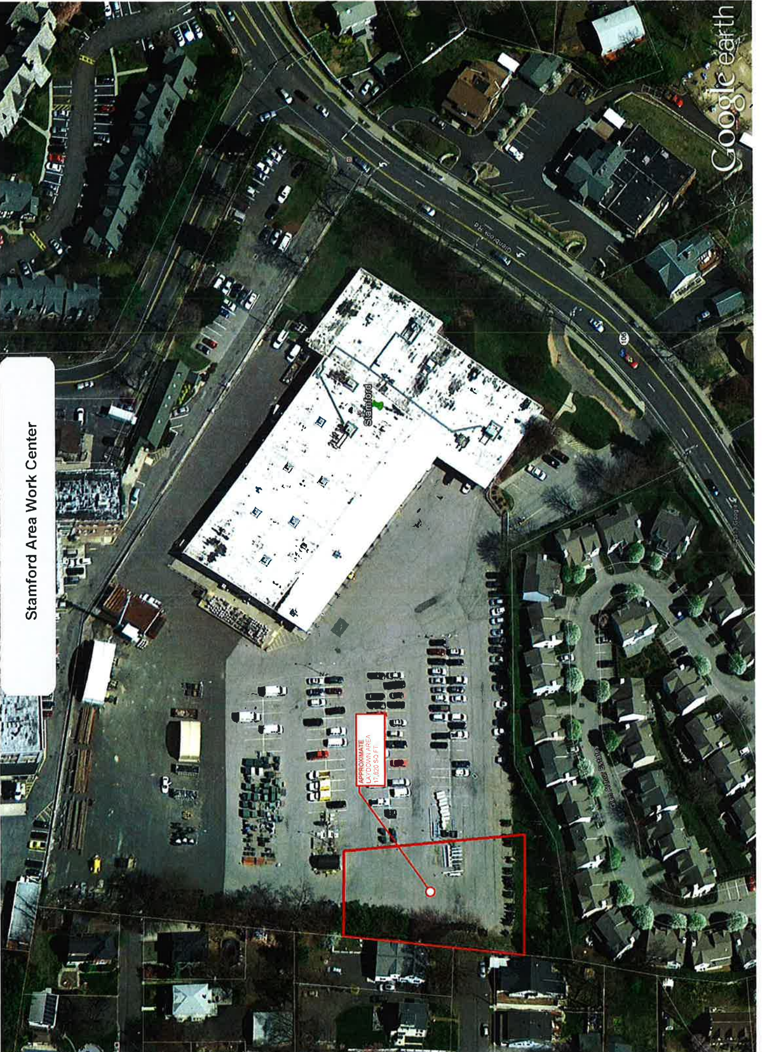
Stamford Area Work Center