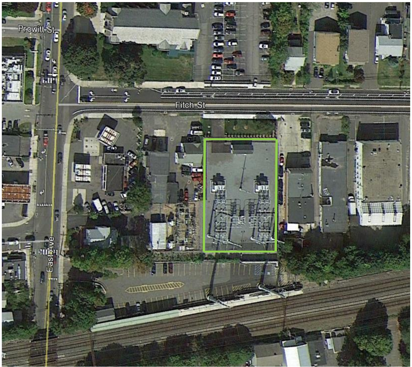
Site location at 6 Fitch Street. Substation compound outlined in green. (2014 google earth image)