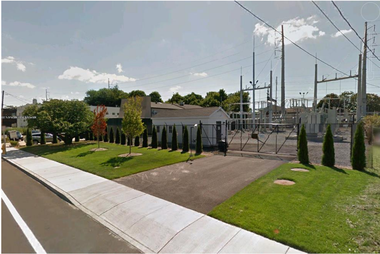
View southeast from Fitch Street. (2014 google earth image)