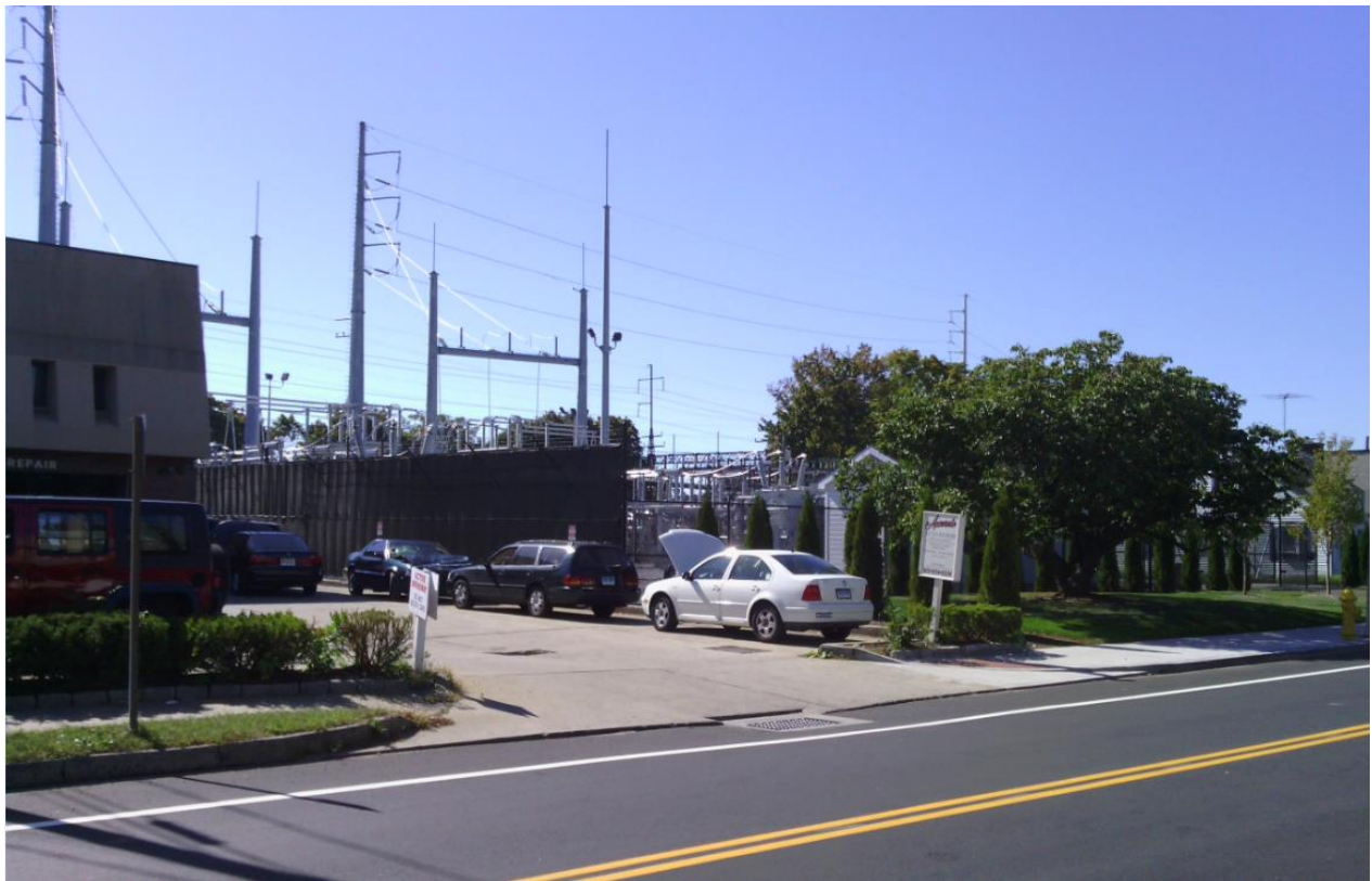
View southwest from Fitch Street with autobody shop to left.