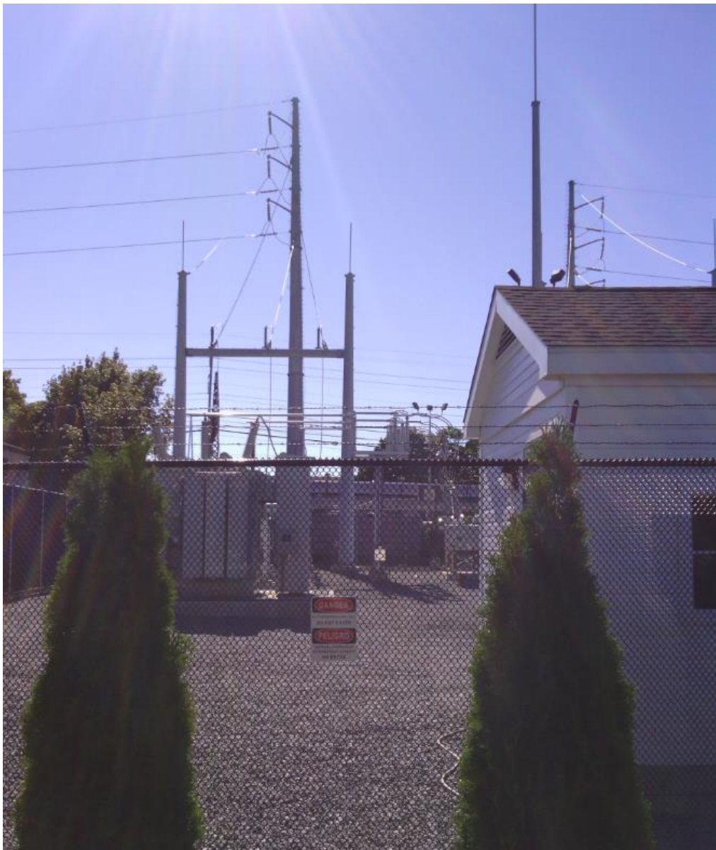
View south from Fitch Street, large structure in background is along railroad.