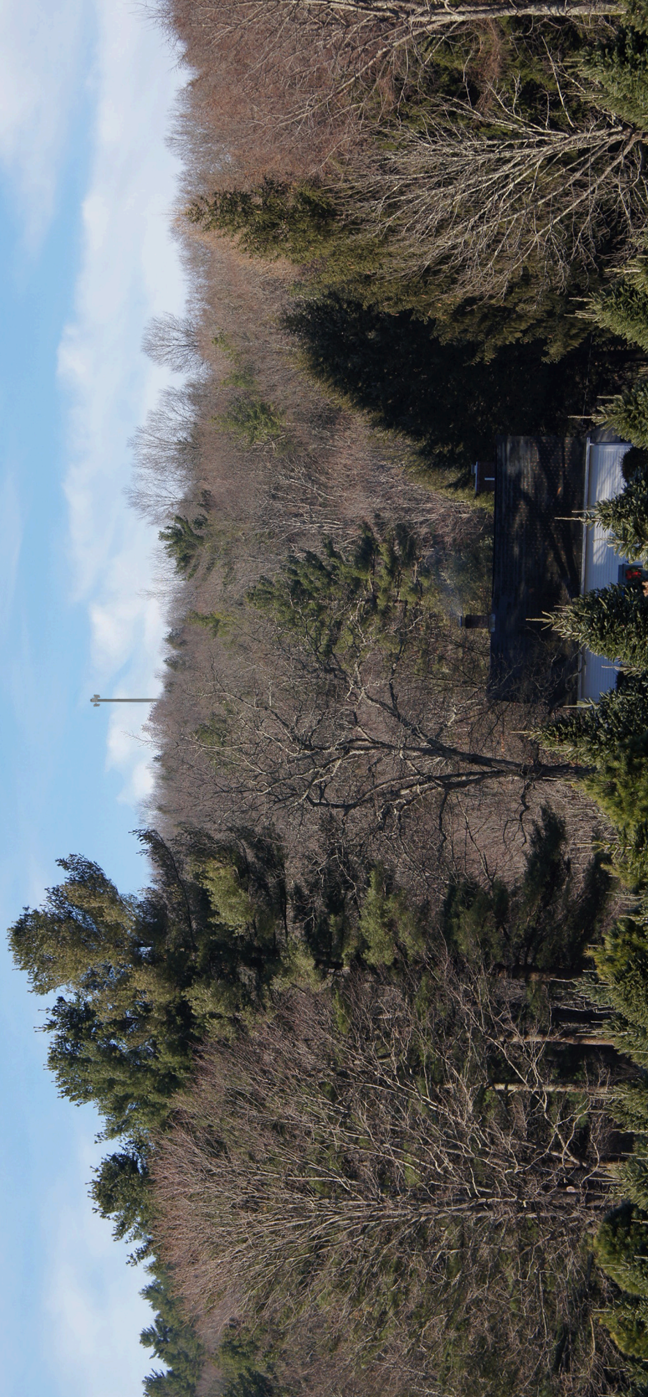
Woodstock - Photo 5 (12/2/11) CT1182

150' Low-Profile Monopole Simulation View from Shaw Road, 200' NW of the intersection with Rt. 171, approx. 0.51 miles East-Northeast of the proposed site. Focal length approximately 55 mm.