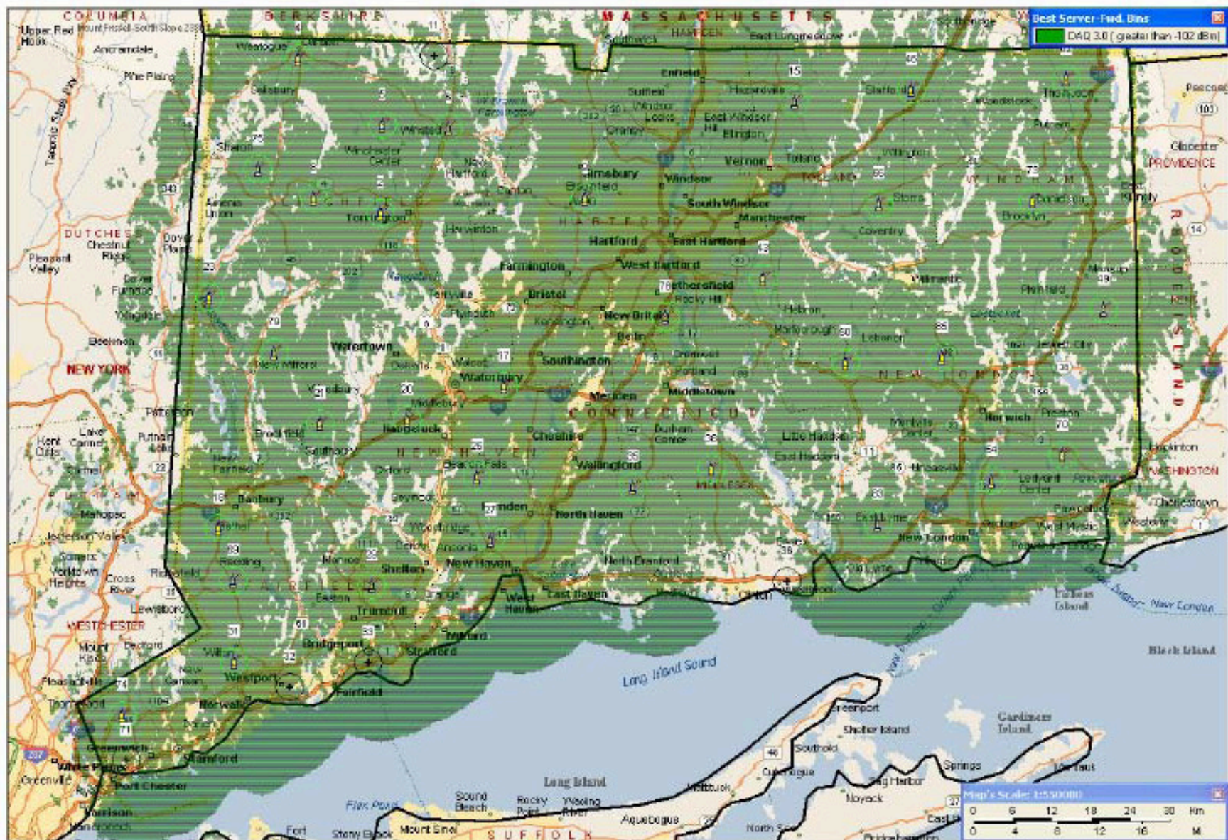
Figure 2: Talk Out, Portable, Existing Sites