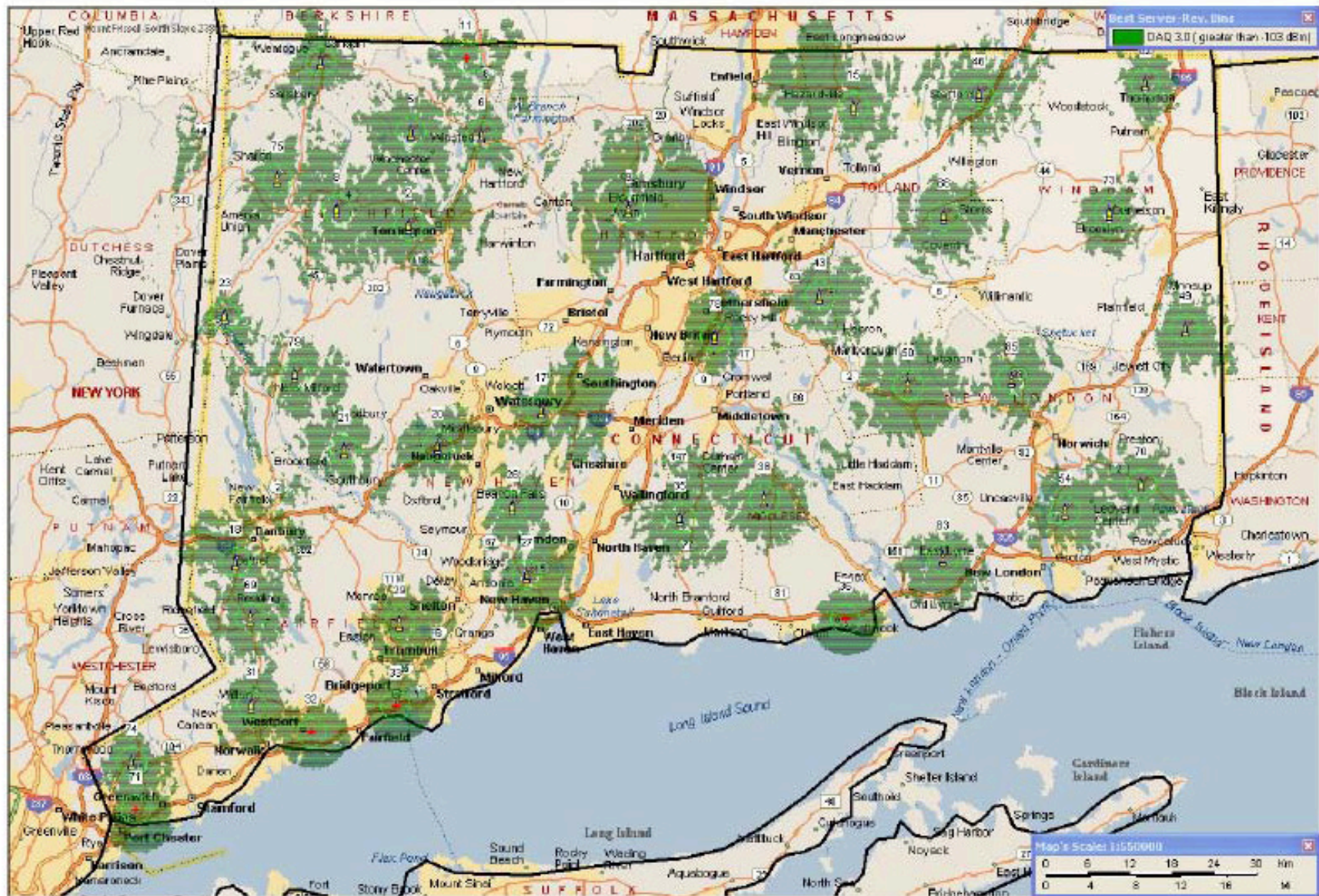
Figure 4: Talk In, Portable, All Sites