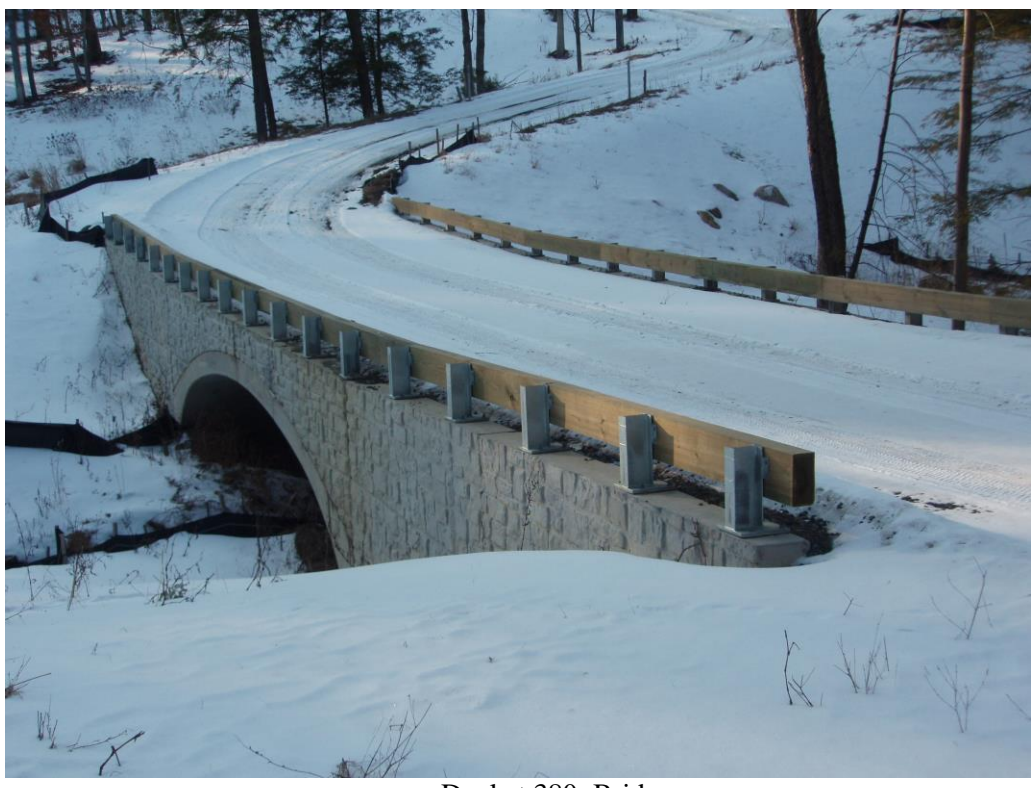
Docket 380: Bridge