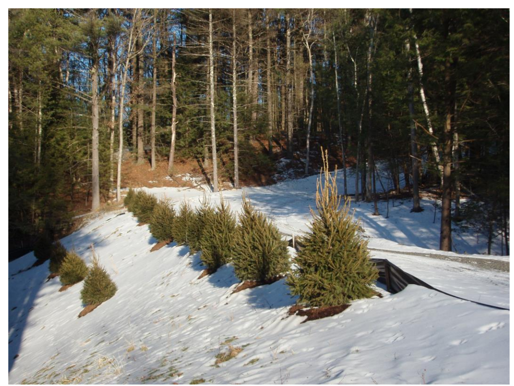
Docket 380: Access road embankment