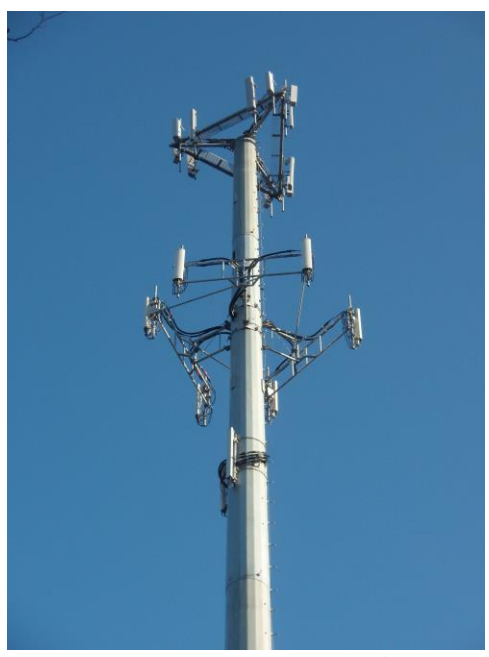
Docket 380: Antenna loading