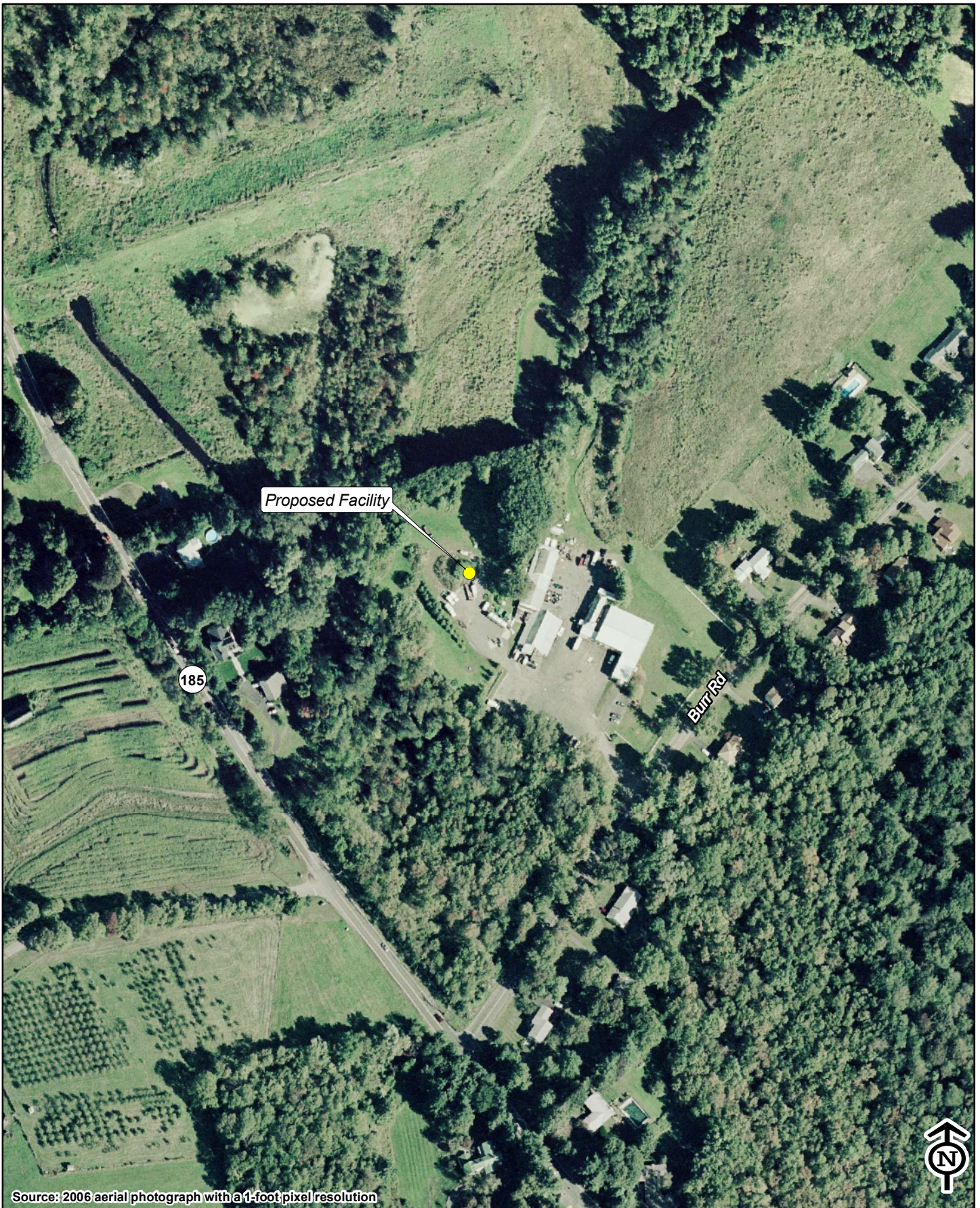
Source: 2006 aerial photograph with a 1-foot pixel resolution