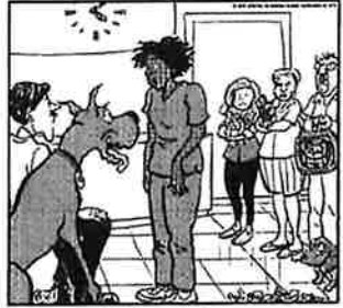
"Everyone in the waiting room wants Marmaduke to go next."

According to the National Sleep Foundation, certain lifestyle habits may help people fall asleep faster and sleep more soundly which reduces any sleep apnea a person's ability to enjoy a restful night's sleep. In lieu of wine, bread, refined grains and sugar-rich baked goods, all of which can reduce melatonin levels, the NSF recommends whole grains. The buildup of serotonin in the brain during periods of wakefulness contributes to the onset of sleep later in the day. It is serotonin levels in the brain that are elevated, then people may experience difficulty falling asleep. The NSF also recommends almonds and walnuts, which contain melatonin, a hormone that helps to regulate the sleep/wake cycles. In addition, foods that are high in tryptophan, such as turkey, chicken and turkey, may increase the production of serotonin, potentially contributing to a restful night's sleep.