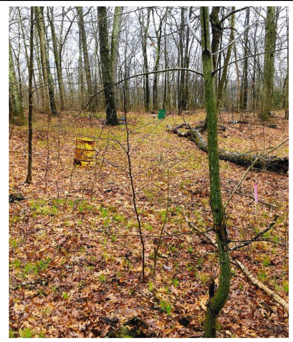
Site A (Bald Hill Road Neighbors' Responses to Applicants' Interrogatories)

22. Site A contains scattered debris, including commercial/industrial-type metal barrels visible from neighboring properties and in publicly available aerial photographs. One such barrel is yellow in color and shows text reading, "Specialized Lubricants". The Applicants did not disclose to the Council any contents of such barrels or supply Phase II testing to the Council. (Applicants 4, responses 32& 33; BHRN 4, response 3. (Photos from Bald Hill Road Neighbors First Set of Interrogatories, Applicants' Response to the Siting Council First Set of Interrogatories, Testimony of Peter Fitzpatrick, at 2-3 Question 8, Applicants' Response to Siting Council Interrogatories Set II).