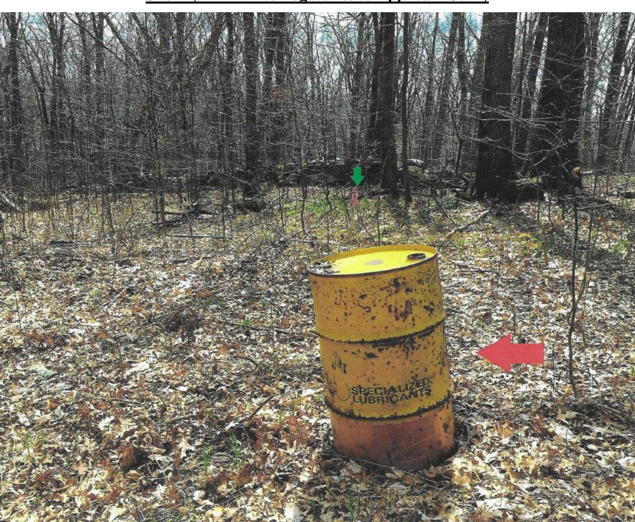
Site A (BHRN Interrogatories to Applicant Set 1)