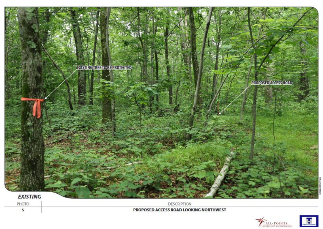
SITE A – Bald Hill Road (Applicants' Supplemental Filing)