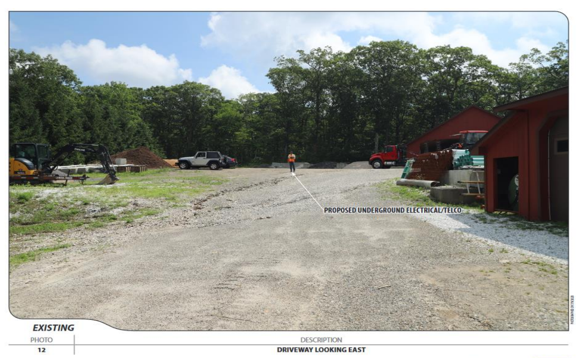
SITE B – Richards Road (Applicants' Supplemental Filing)