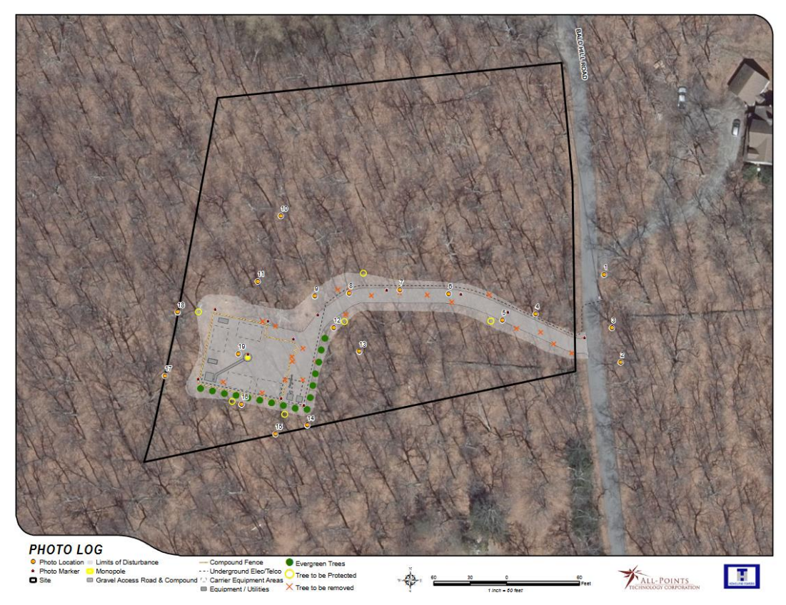
Site A Photo Log (Applicants' Supplemental Filing)