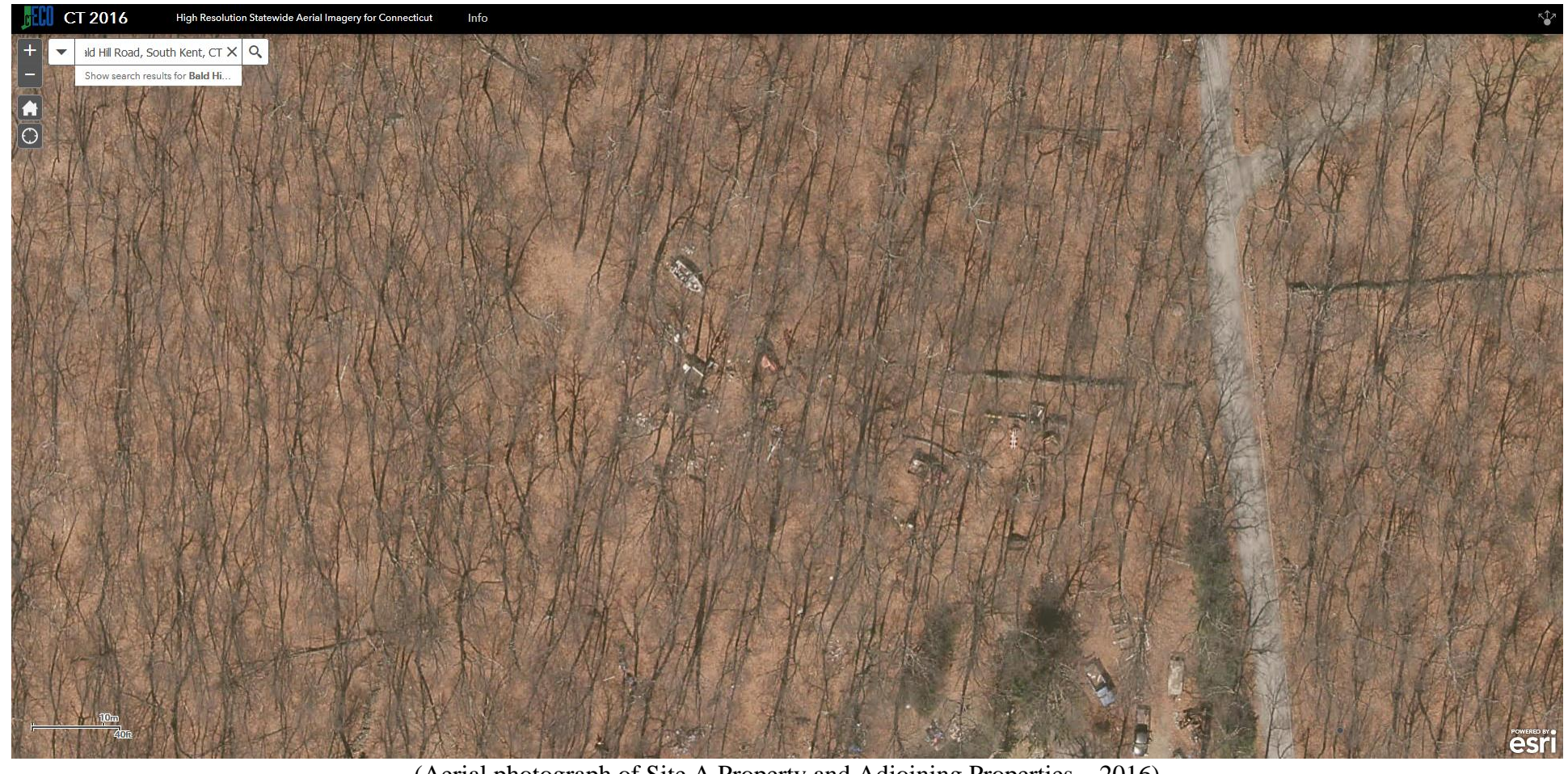
(Aerial photograph of Site A Property and Adjoining Properties – 2016)