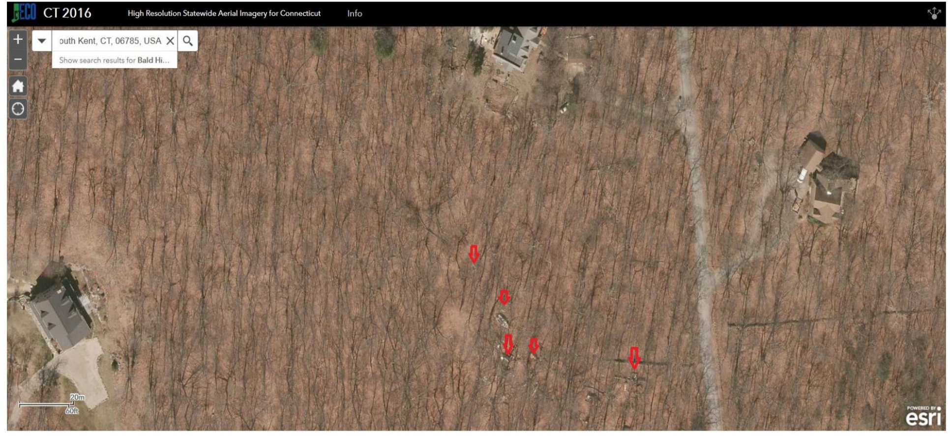
(Aerial photograph of Site A Property – 2016)