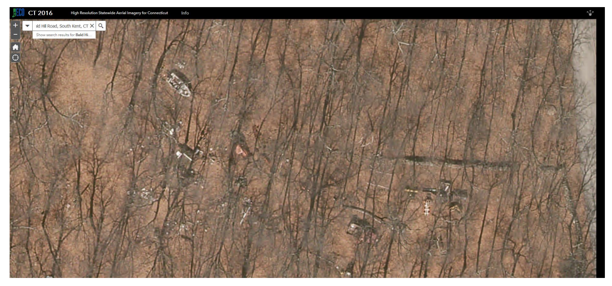
(2016 Aerial Close-Up of Debris Shown Above)