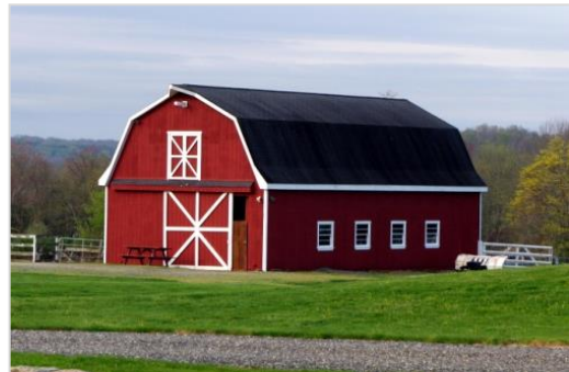
20 th Century Vernacular Barns

Barn and farm buildings are utilitarian in nature, usually lacking the stylistic details of domestic architecture. What they lack in detail they often make up in graceful proportions and a simple graceful aesthetic. Older barns are generally timber framed, often with vertical sheathing. “English” barns used throughout the 17 th and 18 th centuries have their main entrance on side gable walls and lower-pitched roofs. Windows were rare in barns of this type.