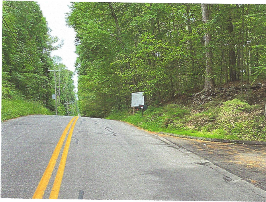
View of public notice sign posted at 1837 Ponus Ridge Road by existing driveway entrance to site. Photo view is looking north.