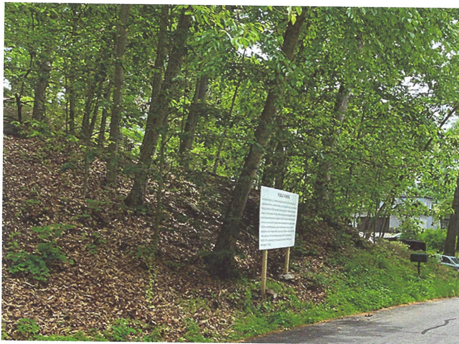
View of public notice sign posted at 1837 Ponus Ridge Road by existing driveway entrance to site. Photo view is looking south.