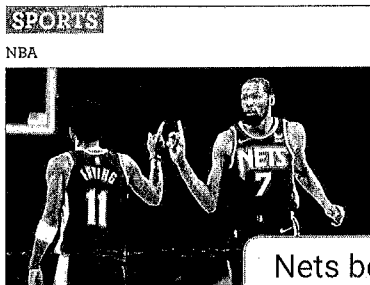
The Nets' Kevin Durant, right, reacts with Kyrie Irving during the second half against the Indiana Pacers on Sunday in New York.

Monday, April 11, 2022 | Stamford Advocate | B5