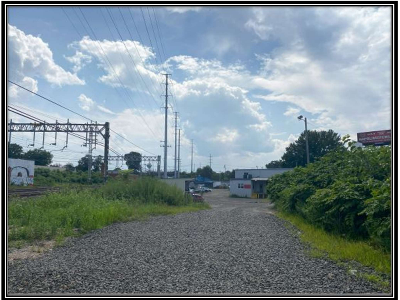
Completed North Side Line Rebuild-Facing S/SW

Commencement of Operation and Construction Completion