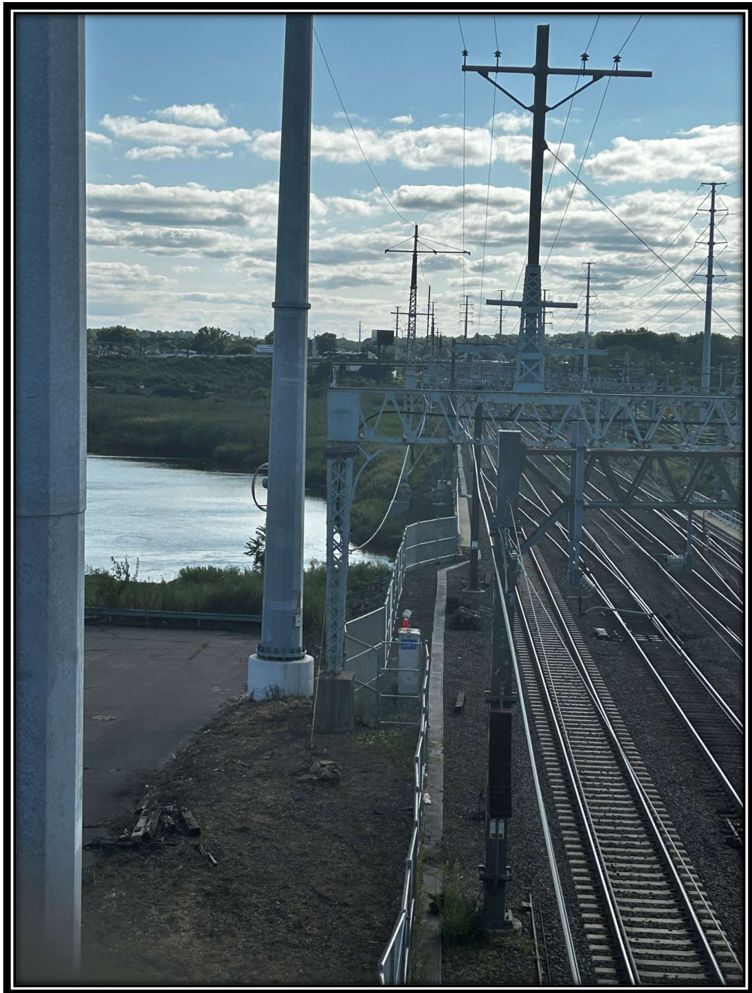
Completed South Side Line Rebuild-Facing South and the West River

Commencement of Operation and Construction Completion