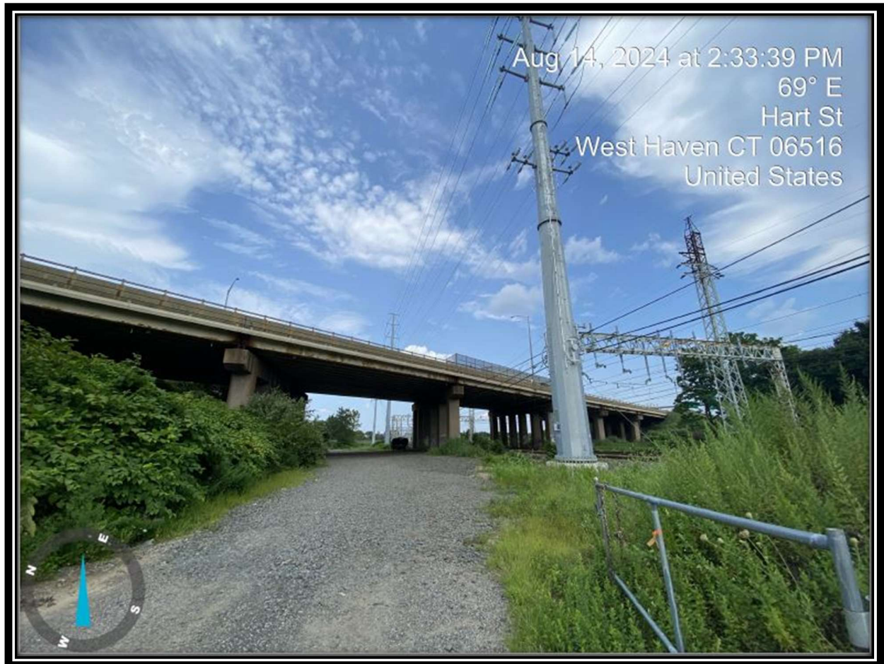
Completed North Side Line Rebuild-Facing N/NE

Commencement of Operation and Construction Completion