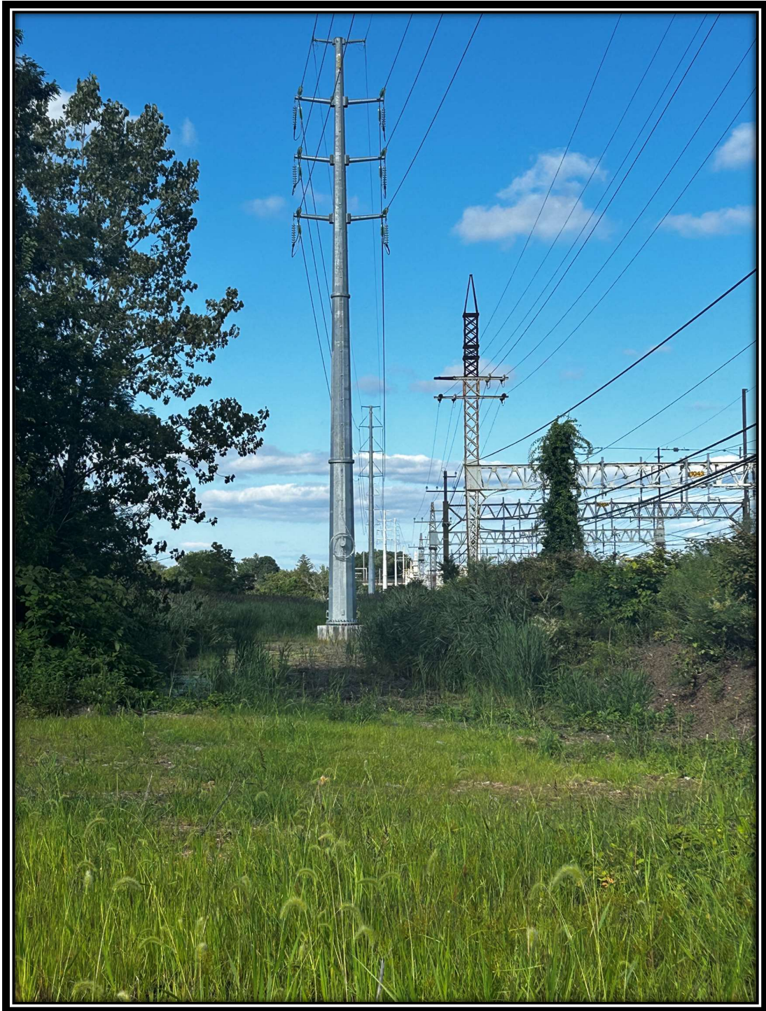
Completed North Side Line Rebuild-Facing N/NE towards West River

Commencement of Operation and Construction Completion