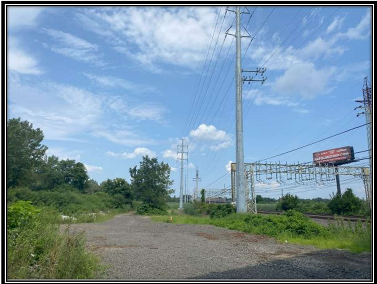
Completed North Side Line Rebuild-Facing N/NE

Commencement of Operation and Construction Completion