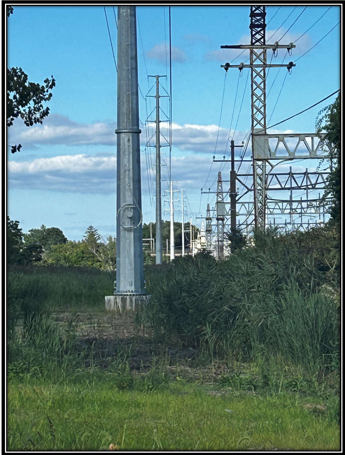
Completed North Side Line Rebuild-Facing N/NE towards West River

Commencement of Operation and Construction Completion