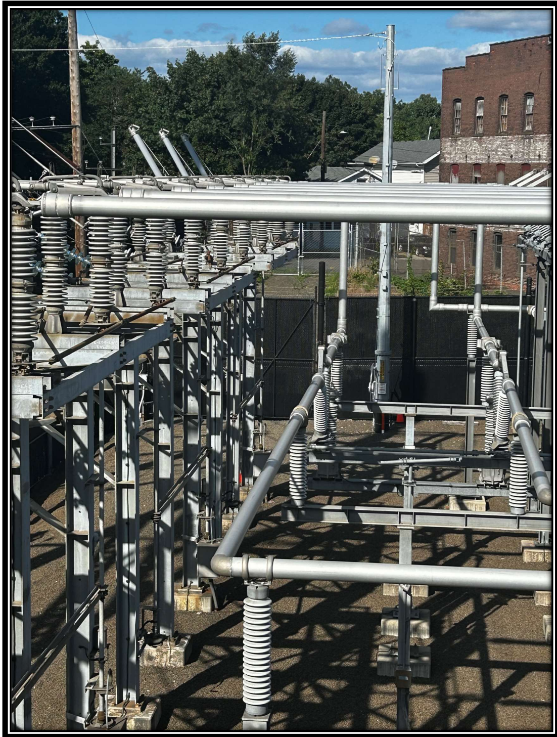
West River Substation-Interior

Commencement of Operation and Construction Completion