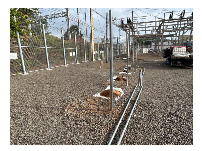
<u> Photo 2: </u> Temporary fencing inside Elmwest Substation, used to gain access to install structures P1029WNS and P1029SS.

<u> Photo 1 </u>: Temporary fencing inside Elmwest Substation, used to gain access to install structure P1029ES.