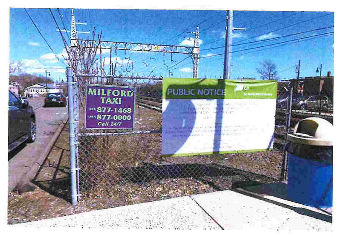
Intersection of Marsh Hill Road and Metro North Railroad in Orange, CT