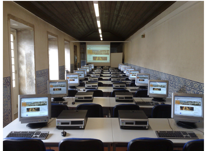
Figure 10: Computer classroom.

POST certified instructors from CJIS and Regional Academies have conducted more than 15 classes at POST-C's Meriden, Bridgeport, New Haven, Hartford, New Britain, Milford, and Waterbury academies. Through POST-C Certification, CISS has been introduced to more than 375 recruits from