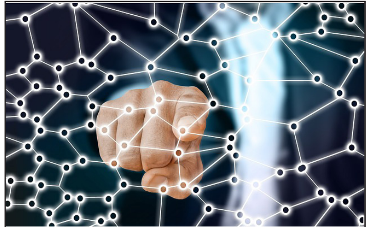
Figure 6: Tapping into the network

Analysts International Corporation (AIC) for maintenance and support of CISS.