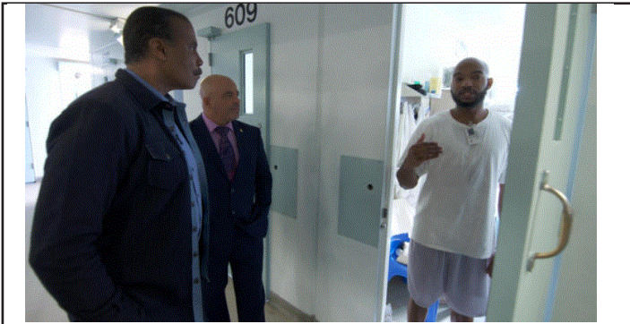
Figure 2: CBS 60 Minutes correspondent Bill Whitaker visits the Cheshire Correctional Institution to report on Connecticut's prison reform program.

In order to help inmates transition back into society, Cook said DOC has two main obligations: to get inmates healthy and to get them educated.