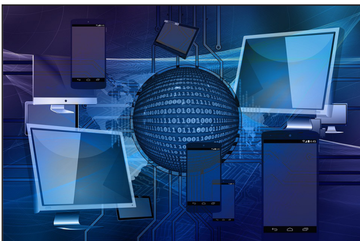
Figure 5: Computer and hand-held device digital connection

With the end of Phase 1 development and implementation, the Criminal Justice Information System (CJIS) will move toward an operational support model. As part of this effort, CJIS has contracted