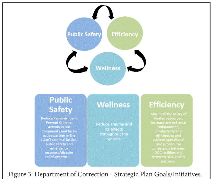
Figure 3: Department of Correction - Strategic Plan Goals/Initiatives

When people go to prison, especially for several years, Cook said the world outside goes. Changes to society, especially changes in technology, can make it more difficult to re-acclimate. That is why DOC will embark on a program to make tablets available to inmates.