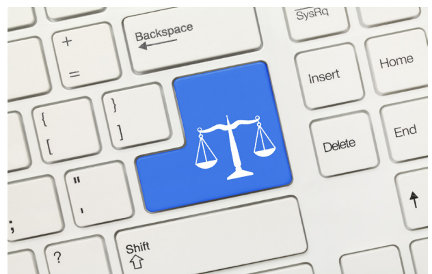
Figure 9: Computer Keyboard showing the scales of justice.

As CISS provides more sources of information and access is requested by new users, CJIS Roadmap expects members of the criminal justice community will find a myriad of uses for the application. We look forward to learning about those uses and sharing that information with our readers.