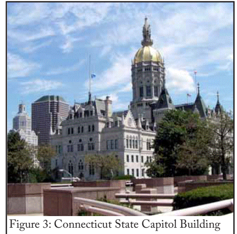
Figure 3: Connecticut State Capitol Building

The first report on prosecutorial data collected under this new law is to be made available to the Criminal Justice Commission, the legislature's Judiciary Committee, and a public website by July 1, 2020.