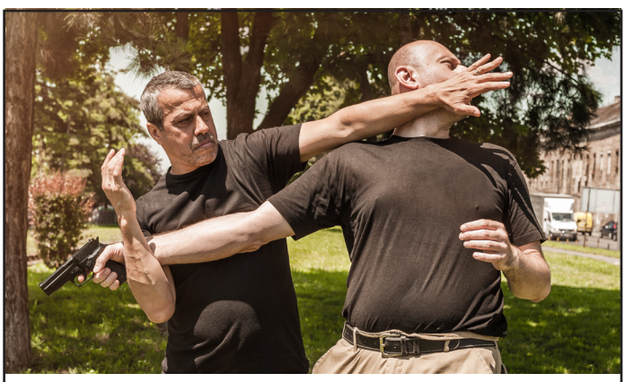
Image #2: Demonstration of an individual disarming an armed person

The new law refers to use of force that potentially could result in serious physical injury. Barone has advised police departments to err on the side of caution regarding which reports to send.