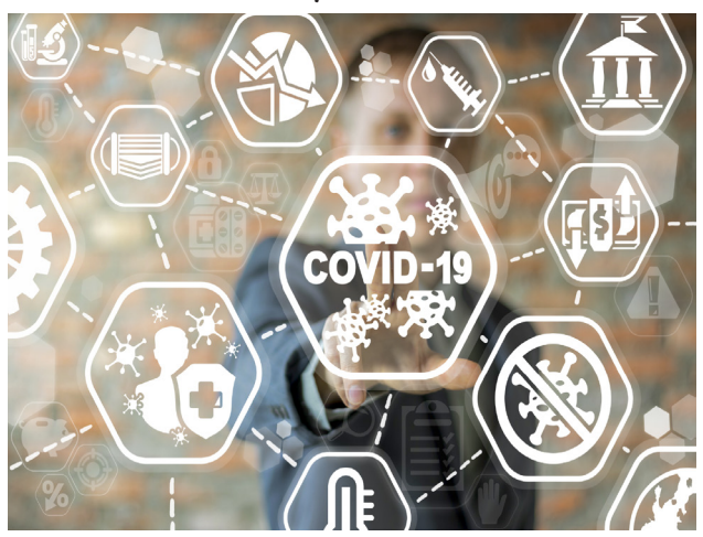
Image #1: Technology during COVID-19

Following the Governor's guidance, CJIS personnel have been authorized to work at home. As such, we are following the "Stay Home, Stay Safe" guidelines, while maintaining essential functions.