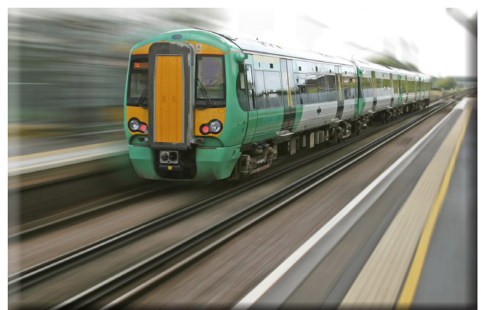
Figure 7: Speeding train.