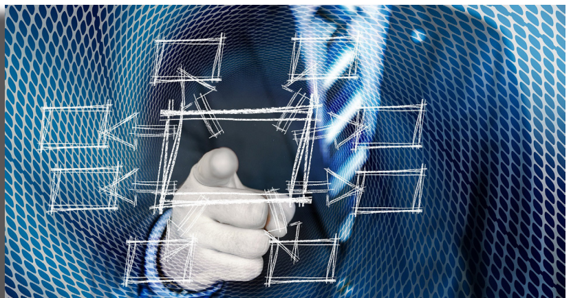
Figure 14: Man pointing finger to connect to several sources.