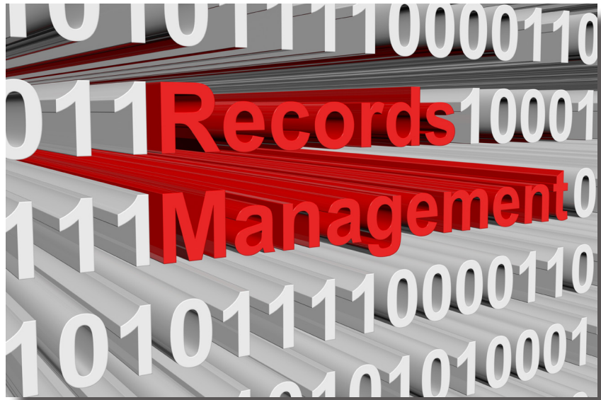
Figure 3: Graphic of records management as data

Each RMS Vendor is completing the integration in two (2) steps. The first step (Level 1) includes sending booking information to CISS in real-time while a person is being booked at a police department. This is the Early Arrest Notification.