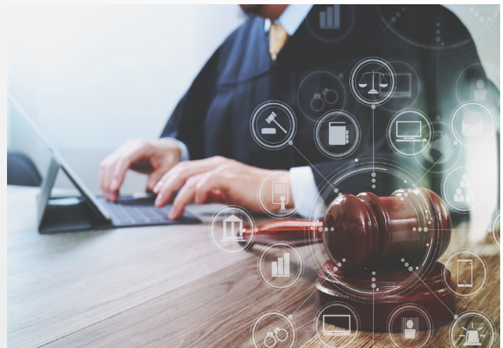
Figure 9: Judge using a computer notebook to access criminal justice information.

Approximately 40 states have used a data-driven Justice Reinvestment (JR) approach with assistance from one of the national organizations, including The Council of State Governments Justice Center, providing assistance with a private-public partnership