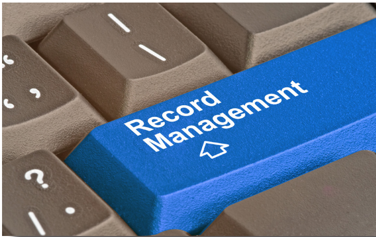
Figure 5: Image of a keyboard with a key label "Record Management."

(Continued: Update on RMS Vendor Progress)