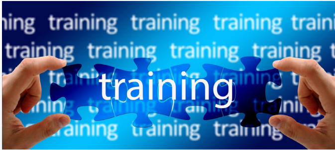
Figure 8: Training puzzle piece.

is avoiding the somewhat complex process and multitude of paperwork steps, previously employed. Additionally, it has been a strong incentive for training and usage. To further improve and simplify the access process, CJIS is developing a web-based online AutoCUAR portal, to replace the paper CISS User Authorization Request (CUAR) manual process. Additionally, the CJIS Deployment Team is developing a shortened training program that will get users access into the system in 30 minutes and then embed CJIS trainers at police departments to show users how to fully access and utilize CISS in an on the job setting. The revamped training approach is more appropriate for the larger departments but will be offered as an option for any police department where it fits and saves time and effort to get the officers into and actively using this great new crime fighting tool CISS.