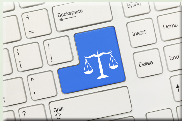
Figure 15: Scales of justice on a computer keyboard.

SB 880 was proposed to address critical gaps in policy makers' ability to make informed