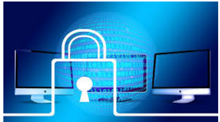
Figure 6: Image of secure computers

To make it easier and faster for departments to connect to the PSDN and CISS, CJIS developed an alternative option using a small-sized low-cost firewall with a pre-configuration that was designed and provided by the SonicWall vendor. The pre-configuration was designed and built by Sonicwall's CJIS Certified Network Engineering Group. The design adheres to strict CJIS security principles and best practices.