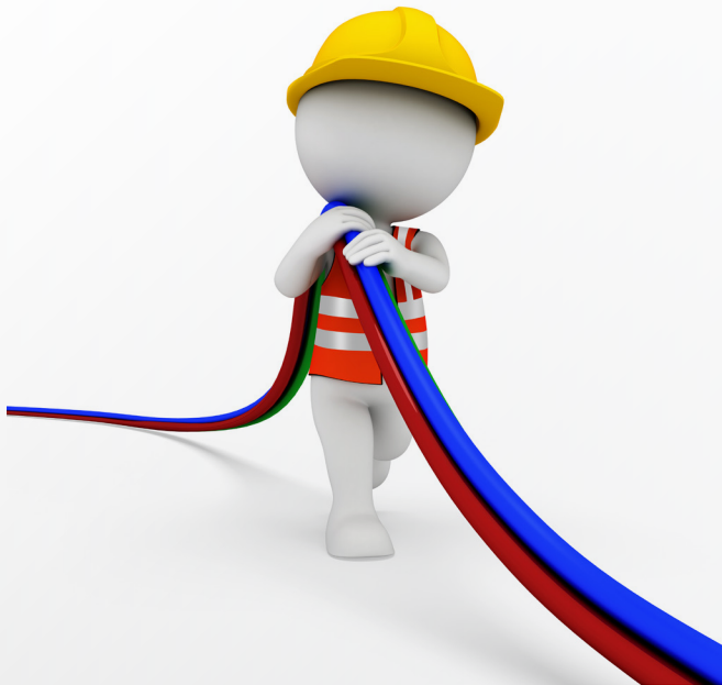
Figure 12: Construction figure carrying cable.

Release 11 (R11) was put into production at the end of January. This has allowed CJIS to begin the rollout of Early Arrest Notification to all NextGen police departments. NextGen is the vendor for records management systems for about 60% of Connecticut police departments.