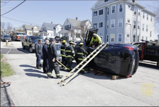
04/21/22 Worcester, MA MVA rollover.