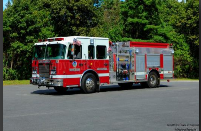
Scott Berliner - FDNY Ladder 125