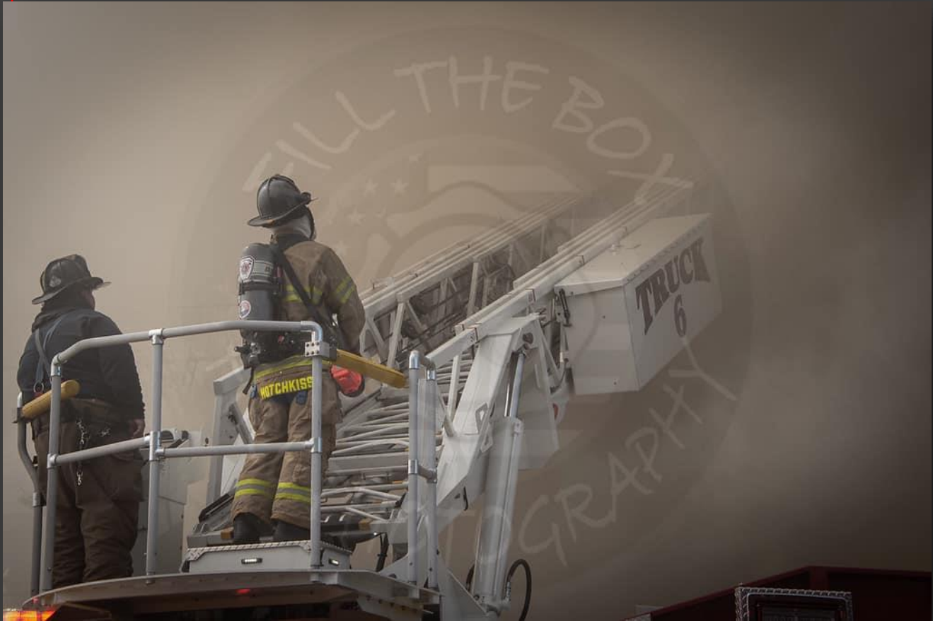
04/20/22 3rd alarm Seymour, CT 4 Bank St.

An International Fire Buff Associates Region 1 Club