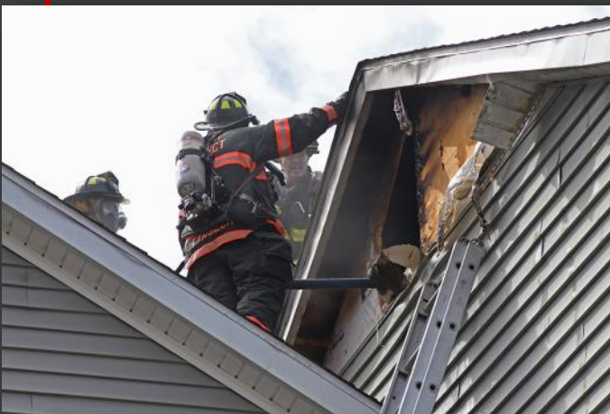
04/21/22 Haddam, CT Plains Rd. dwelling fire - At 2:20 p.m. on April 21, Haddam Volunteer Fire Company, along with multiple mutual aid companies, responded to a structure fire on Plains Road in Haddam. Upon arrival, crews from Middletown South Fire District and East Haddam Volunteer Fire Department searched the home and found one unconscious victim in the kitchen. The victim was immediately treated outside the home and was transported to Middlesex Hospital. Firefighters quickly extinguished the fire. Crews were on scene approximately four hours. Connecticut State Police, the Connecticut Fire and Explosion Investigation Unit, and the Haddam Fire Marshal are investigating the cause of the fire.