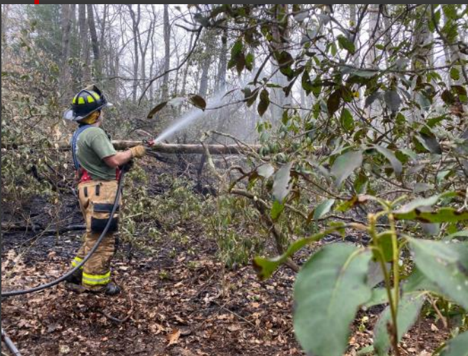
04/21/22 Middletown, CT Cockapansett State Forest brush fire.