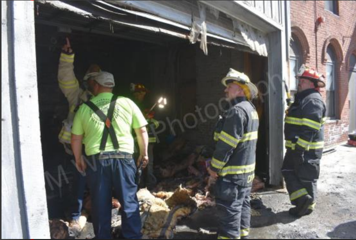
04/29/22 Millbury, MA 95 Main St. commercial garage.