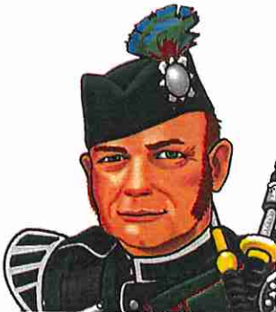
Extended Side Burns