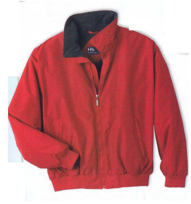
THIS IS ONLY A SAMPLE OF THE JACKET....

CFA Bookstore 860-627-6363 ext. 271 or ext. 244