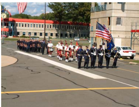
Recruit Class # 36 accompanied by the Connecticut Statewide Honor Guard along with the Pipe and Drum Band.