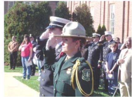
Fire Department Honor Guards participating in the National Fallen Firefighters Annual Memorial Service