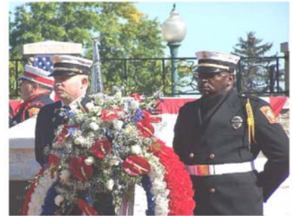
Fire Department Honor Guards participating in the National Fallen Firefighters Annual Memorial Service

Registration can be made via mail or fax