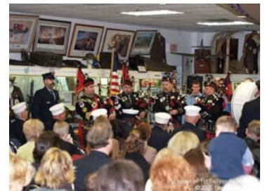
Connecticut Firefighters Pipes and Drums perform Amazing Grace