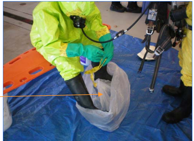
Trash Can Liner