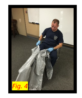
Step 3: Continue donning process (with assistant)