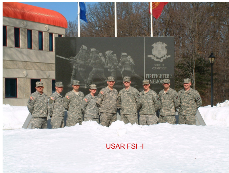
USAR FSI -I

In February, members of the U. S. Army Reserve (USAR) 530th Engineer Detachment, Danvers, MA, from the USAR 368 th Engineer Battalion, Londonderry, NH, completed Fire Service Instructor 1 and Fire Officer 1 as residence programs at the CFA. Training was a requirement prior to deployment to Afghanistan and with a small window of opportunity, the USAR reached out to the CFA for assistance in meeting their mission objectives. Fire Service Instructor 1 was conducted from February 7th through February 12th, including practical and written examination. Fire Officer 1 was conducted from February 14th through February 24th, including practical and written examination. Nine members