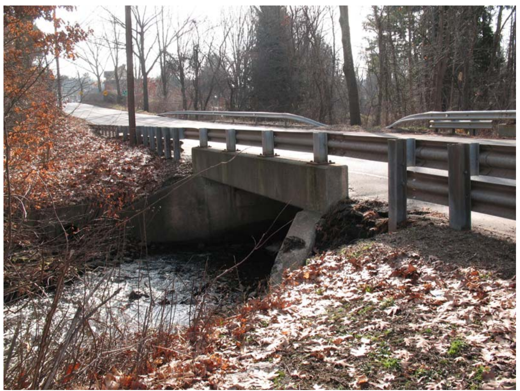
Pipeline Segment 52: Eagleville Brook Culvert beneath Route 32