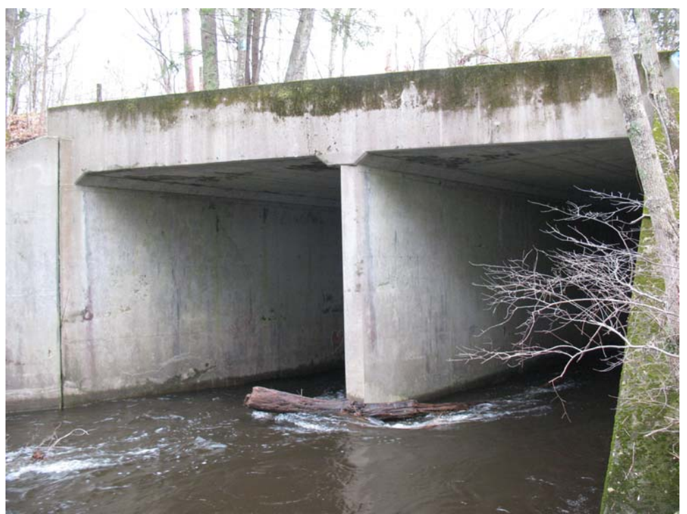
Pipeline Segment 35: Fenton River Box Culvert at Chaffeeville Road