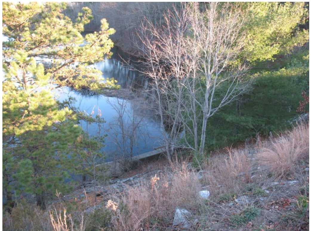
Pipeline Segment 31: Fenton River Box Culvert Beneath Route 89