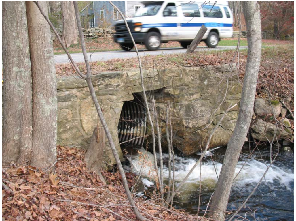
Pipeline Segment 39: Upstream Schoolhouse Brook Culvert on Clover Mill Road