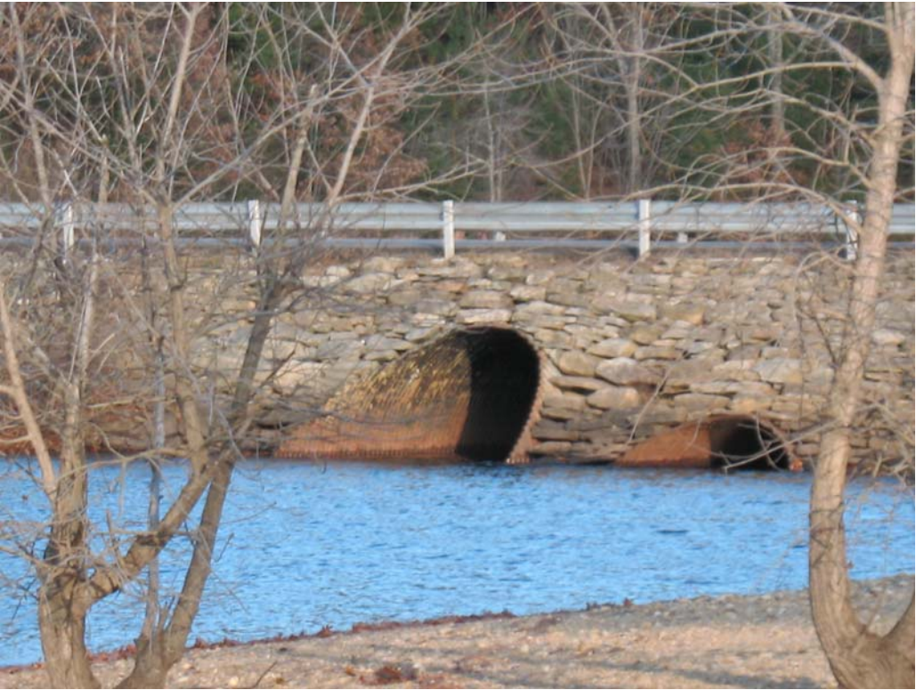
Pipeline Segment 23: Mansfield Hollow Lake Culverts beneath Bassetts Bridge Road