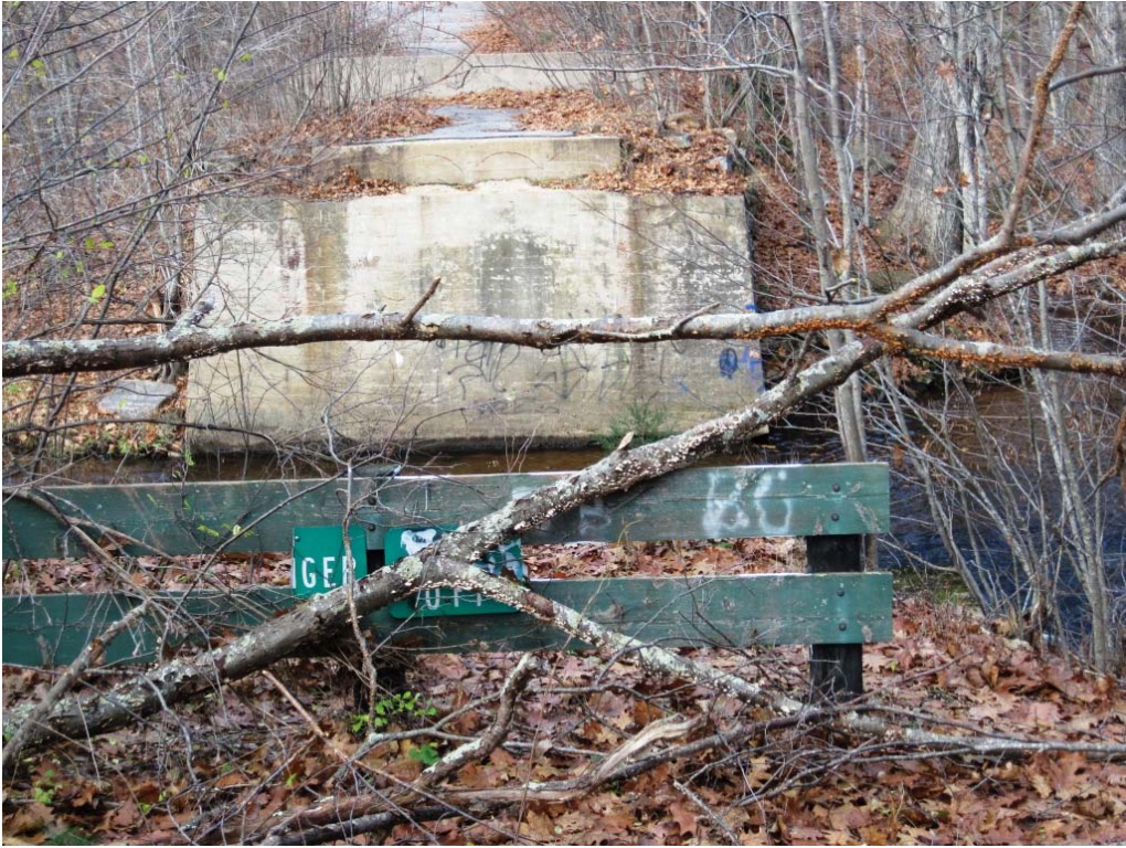
Pipeline Segment 12B: Former Bridge Abutment in Coventry Viewed from Mansfield