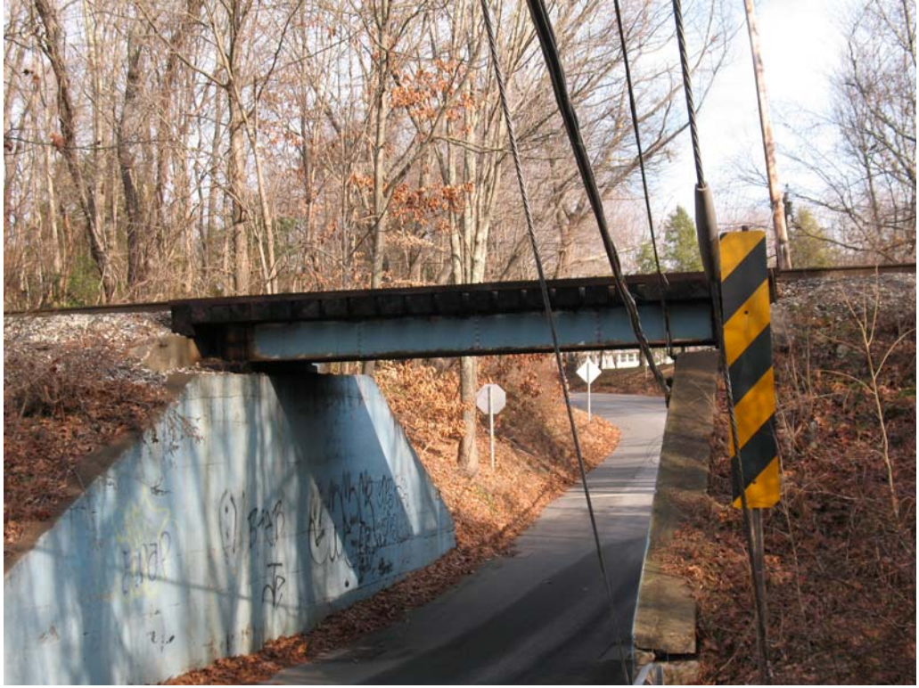
Pipeline Segment 42: Railroad underpass on Route 275 near Willimantic River