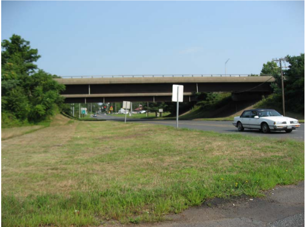
Pipeline Segment 7: Interstate 84 over Slater Street (Manchester)