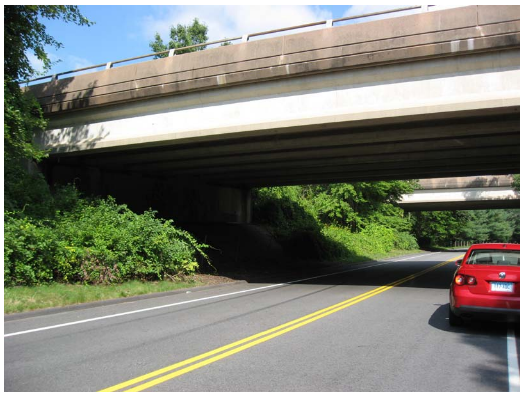
Pipeline Segment 2: Interstate 384 over Finley Street (Manchester)