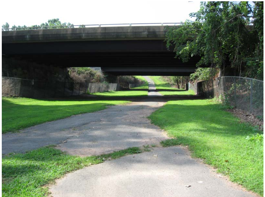
Pipeline Segment 2: Interstate 384 over Charter Oak Park Path (Manchester)