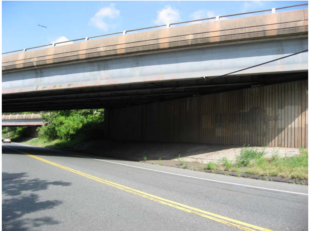
Pipeline Segment 2: Interstate 384 over Campmeeting Road (Manchester)