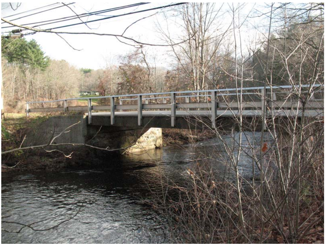
Pipeline Segment 36: Gurleyville Road Bridge over Fenton River