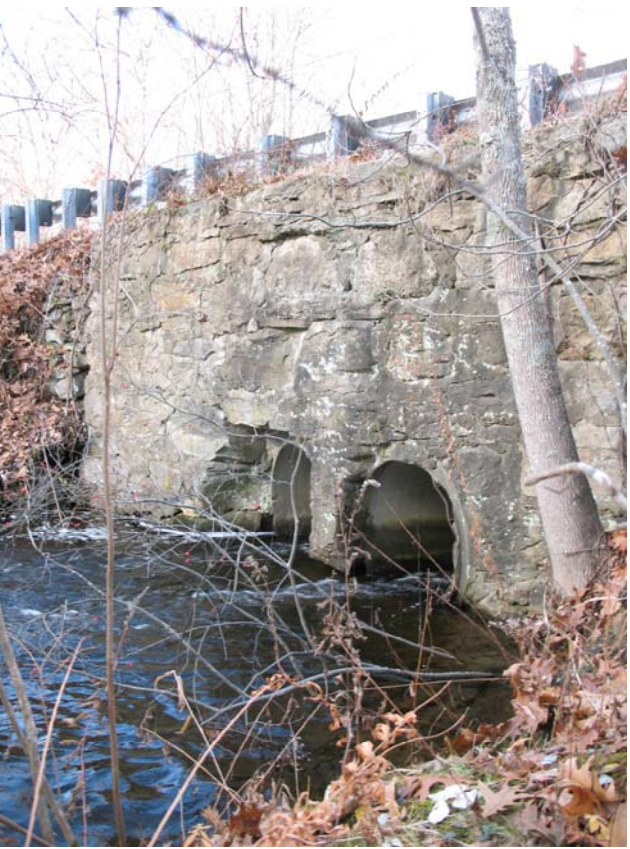
Pipeline Segment 39: Downstream Schoolhouse Brook Culvert on Clover Mill Road