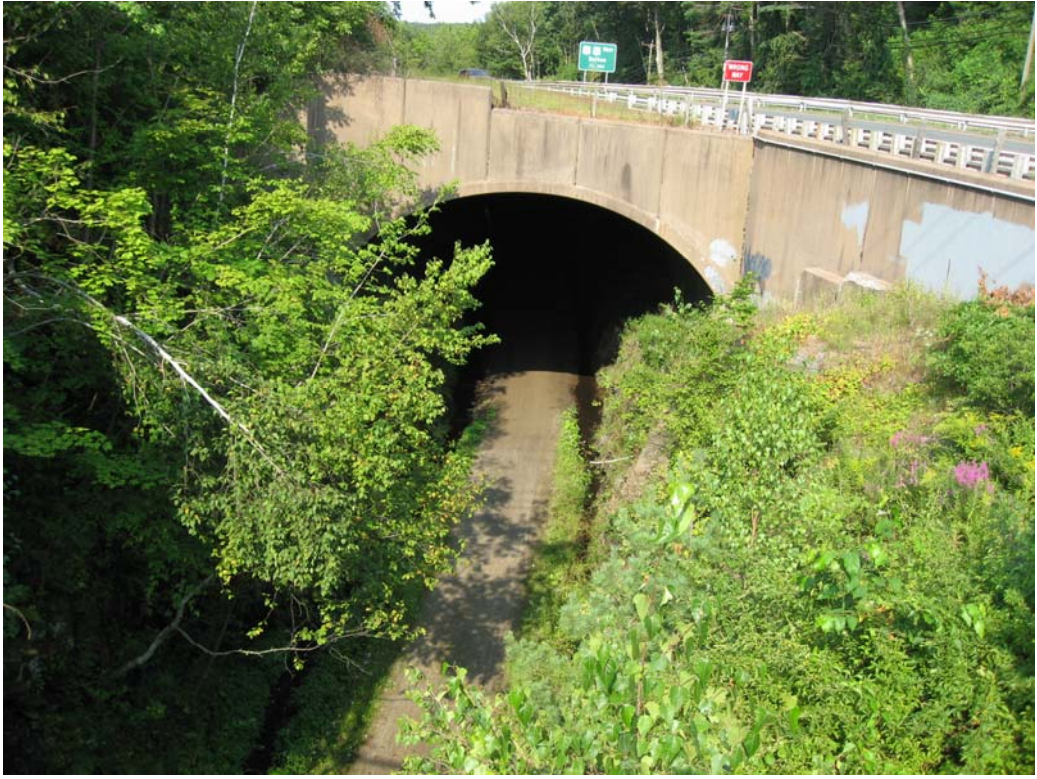
Pipeline Segment 2: Route 44 over Bolton Notch Linear Trail (Bolton)