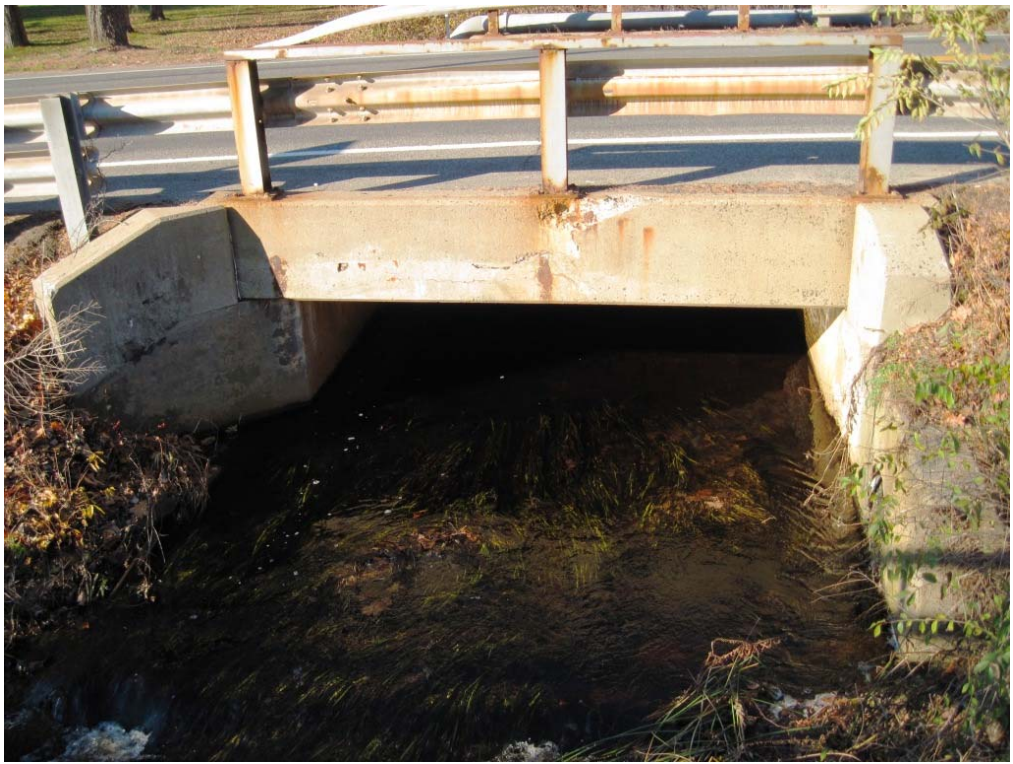
Pipeline Segment 18: Cedar Swamp Brook Culvert beneath Route 44