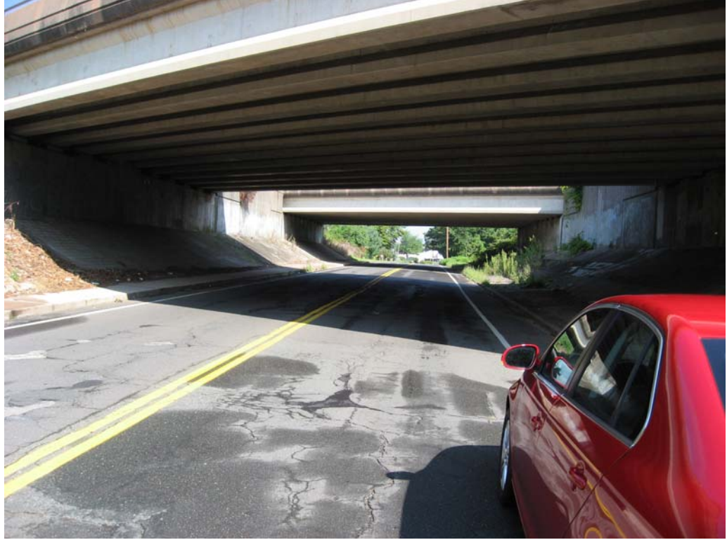
Pipeline Segment 2: Interstate 384 over Bidwell Street (Manchester)