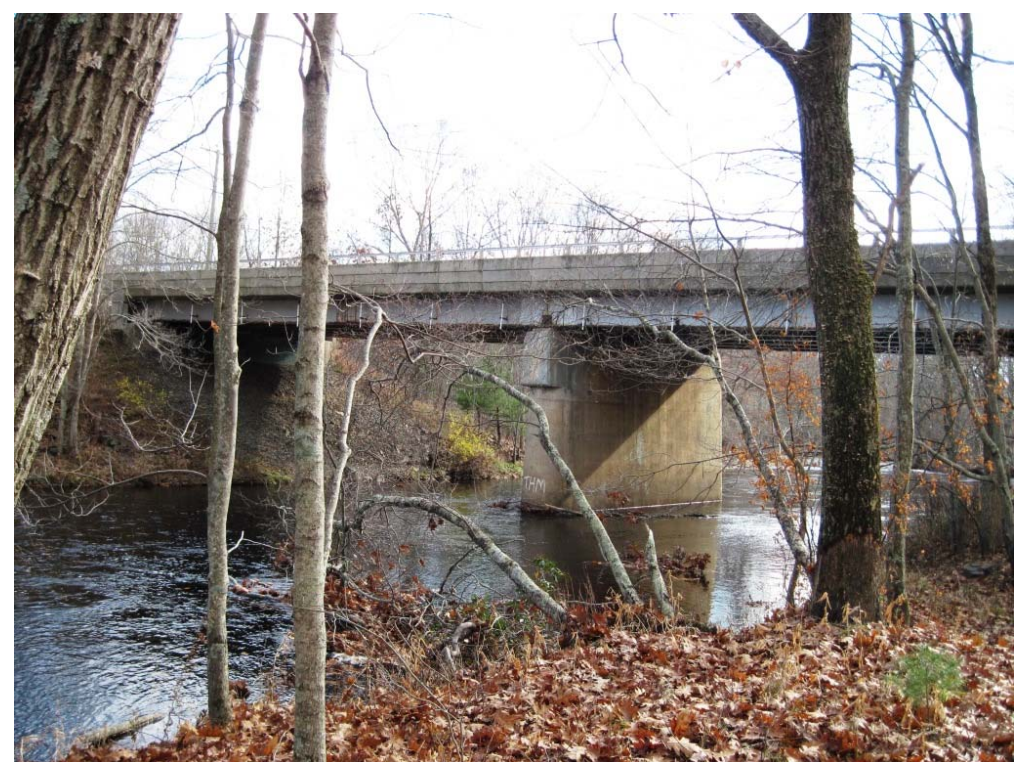
Pipeline Segment 12A: Route 195 Bridge over Willimantic River (Coventry/Mansfield)