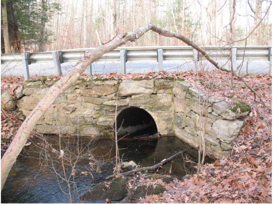
Pipeline Segment 39: Middle Schoolhouse Brook Culvert on Clover Mill Road