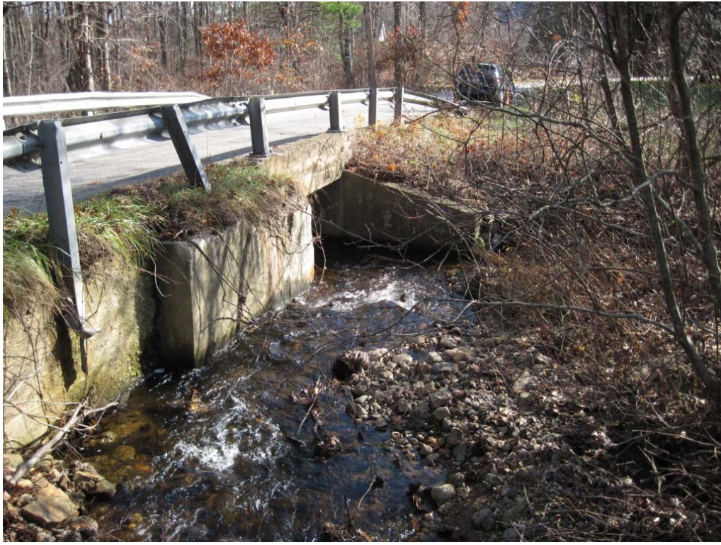
Pipeline Segment 12B: Clark Brook Box Culvert on Jones Crossing Road (Coventry)