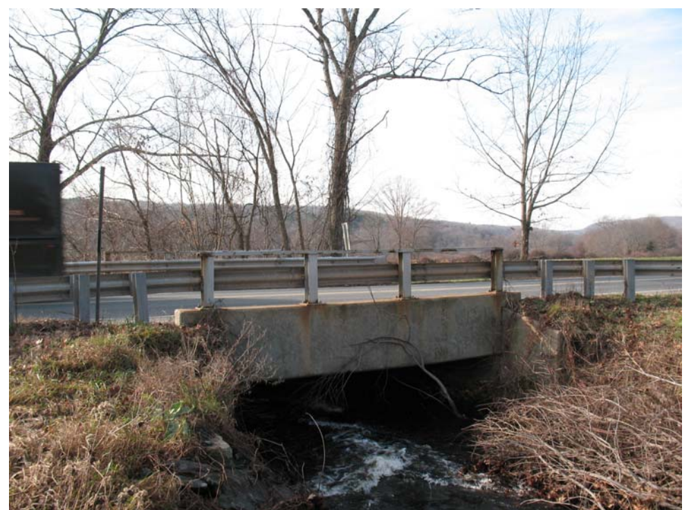
Pipeline Segment 55: Cedar Swamp Brook Culvert beneath Route 32