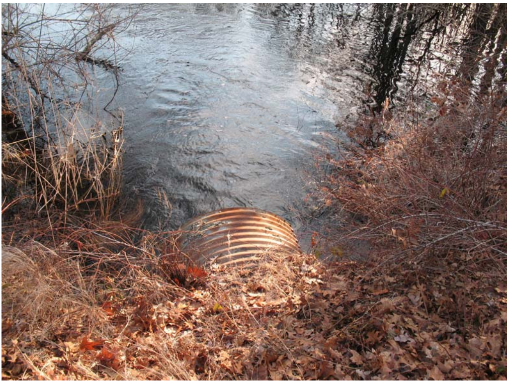
Pipeline Segment 14: Outflow Pipe from Cedar Swamp at Route 195