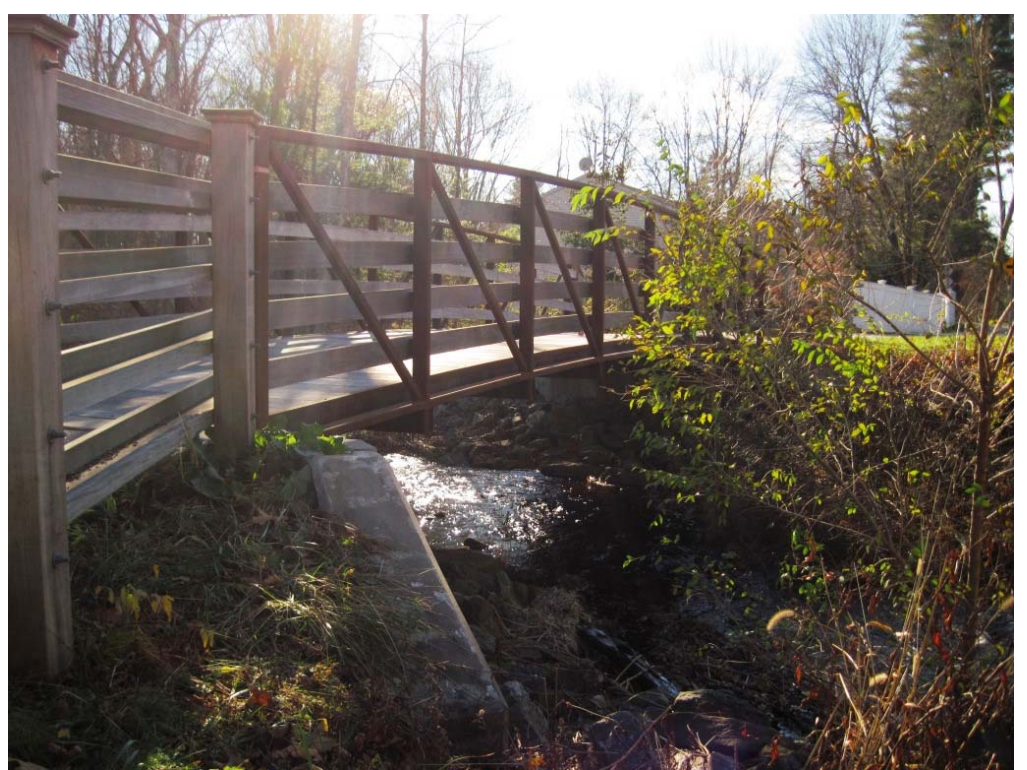
Pipeline Segment 18: Cedar Swamp Brook Pedestrian Bridge