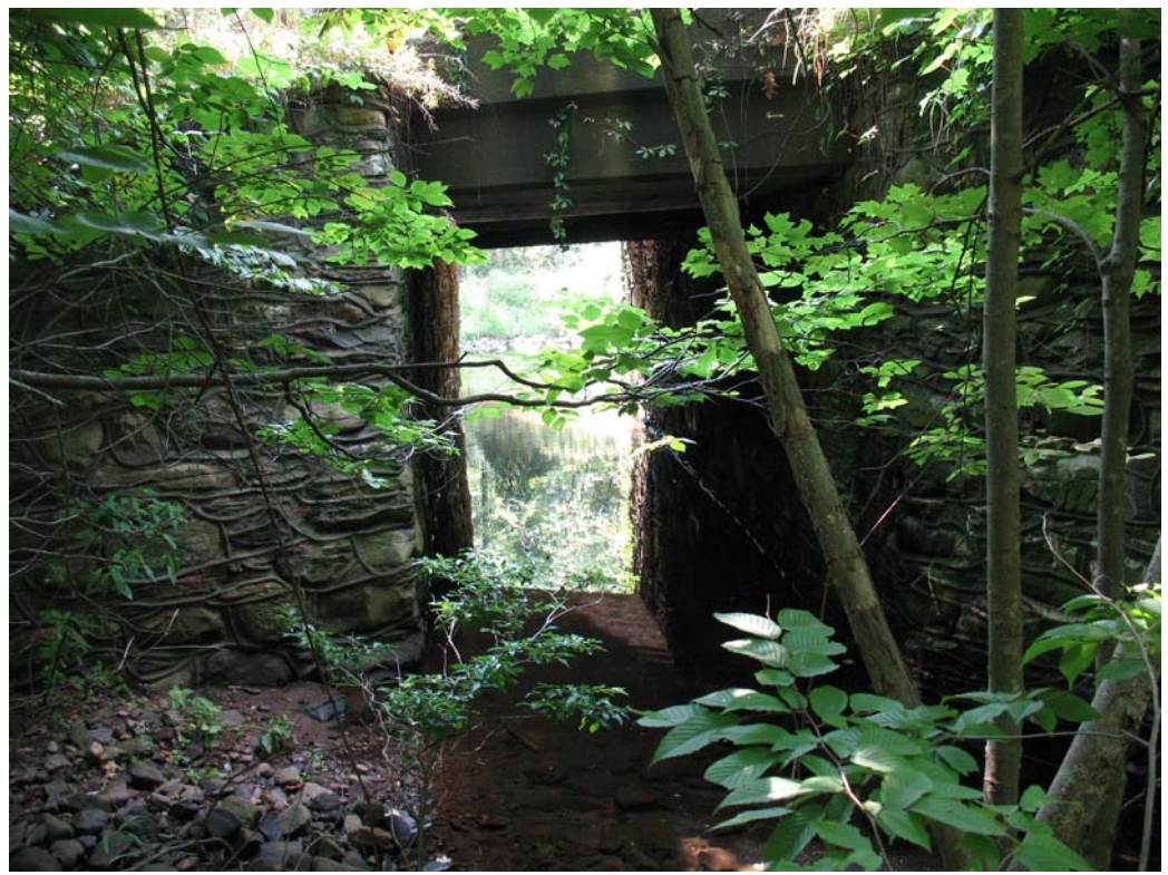
Pipeline Segment 2: Route 44 over Ash Brook (Coventry)