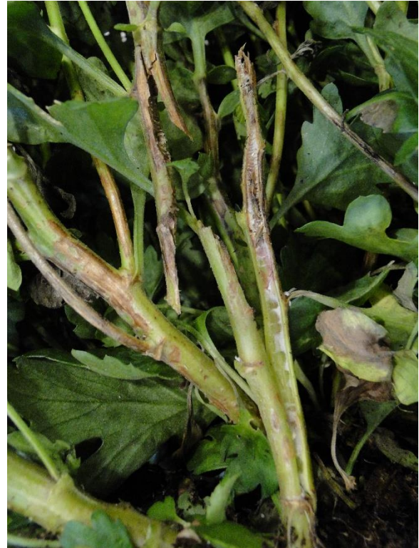
Figure 10. Necrosis of stems and wilting of chrysanthemum infected with TSWV

including the most common western flower thrips. Thrips lay eggs into leaf, bract, or petal tissues. After the larvae hatch from the eggs, they feed on the leaves or flowers. When a larval thrips feeds on the plant infected with TSWV or INSV, it can acquire the virus within 30 minutes, and then retains the virus in its body through pupae and adult stages, but it is not transmitted to eggs. When an adult thrips flies and feeds on host plants, it can spread the virus to the healthy plant. Only larval thrips can acquire TSWV/INSV, but only adult thrips can spread the virus to host plants. TSWV/INSV cause systemic infections and replicate themselves in both vector thrips and host plants. When an infected plant is used as propagation stock, every cutting taken from the plant will be infected with the same virus. Movement of infected plant materials and thrips can result in a long-distance spread of TSWV/INSV.