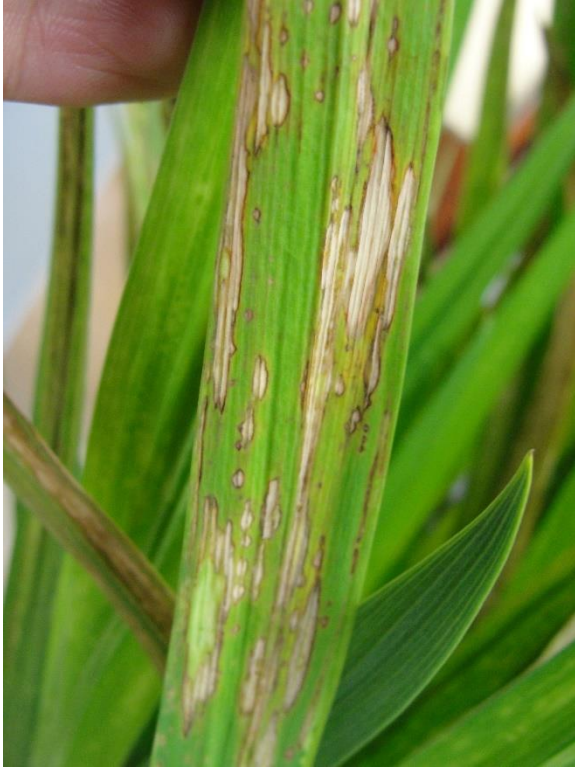
Figure 9. Necrotic streaks on an iris leaf infected with TSWV