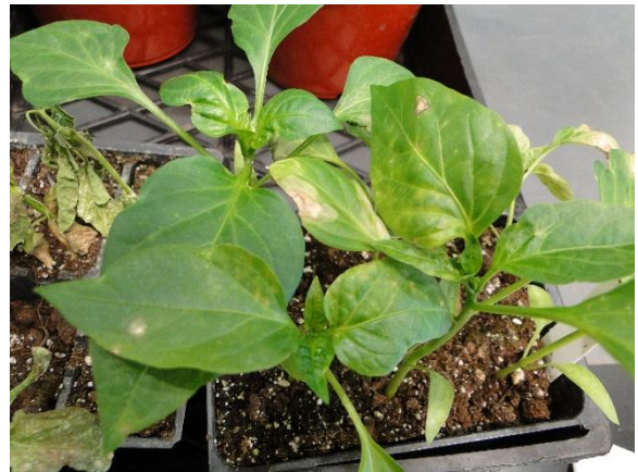
Figure 8. Mottling and distorted new growth of pepper plants infected with TWSV