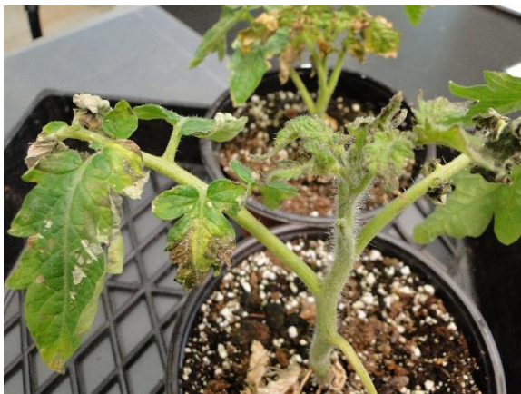
Figure 7. Necrosis of leaves and distorted new growth of a tomato seedling infected with TWSV