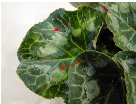
Figure 3. Ringspots (arrows) on the cyclamen leaf infected with INSV