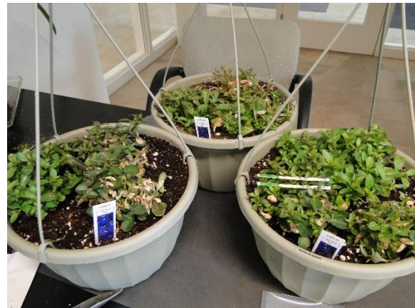
Figure 11. Necrotic and stunted growth of lobelias with mixed infections of TWSV and INSV

including the most common western flower thrips. Thrips lay eggs into leaf, bract, or petal tissues. After the larvae hatch from the eggs, they feed on the leaves or flowers. When a larval thrips feeds on the plant infected with TSWV or INSV, it can acquire the virus within 30 minutes, and then retains the virus in its body through pupae and adult stages, but it is not transmitted to eggs. When an adult thrips flies and feeds on host plants, it can spread the virus to the healthy plant. Only larval thrips can acquire TSWV/INSV, but only adult thrips can spread the virus to host plants. TSWV/INSV cause systemic infections and replicate themselves in both vector thrips and host plants. When an infected plant is used as propagation stock, every cutting taken from the plant will be infected with the same virus. Movement of infected plant materials and thrips can result in a long-distance spread of TSWV/INSV.