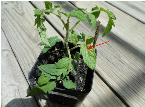
Figure 5. Necrosis of tomato leaves (arrow) infected with INSV

Both TSWV and INSV belong to the genus Orthotospovirus. Viruses in this genus can be transmitted by various thrips species