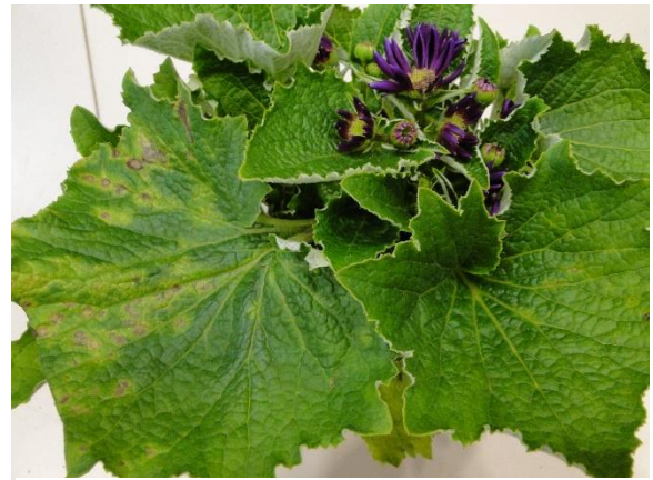
Figure 2. Mottling and necrosis of cineraria leaves infected with INSV