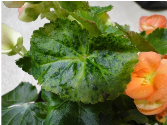
Figure 1. Mosaic and mottling on the begonia leaf infected with INSV

to the greenhouse industry. Both viruses have an extremely wide host range. TSWV can infect more than 900 plant species, while over 300 species are susceptible to INSV. However, rose and poinsettia are two of only