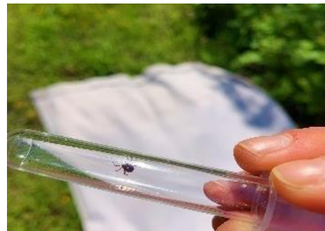
Figure 5. Collected adult female lone star tick. Ms. Jamie Cantoni, The Connecticut Agricultural Experiment Station.

The selected sampling locations represent the type of habitat where ticks would predictably occur (i.e., forested trail systems, brush, grassland, or mixed habitat) and provides a comprehensive depiction of the abundance and distribution of ticks throughout the state. These site-specific samples are then transported back to the Station, identified, catalogued, and subsequently tested for the presence of human disease-causing agents.