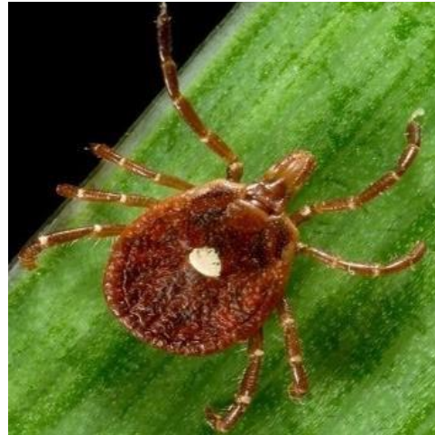
Figure 6. Questing adult female lone star tick.

much smaller and more difficult to detect nymphal stage of the blacklegged tick, where 20% tested positive for the bacterium. In concurrence with assessing tick