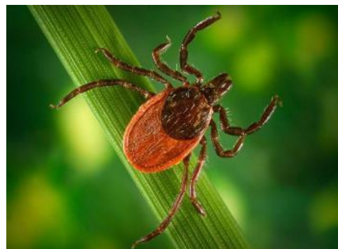
Figure 2. Adult female deer tick, I. scapularis , cdc.gov.

implemented by the Centers for Disease Control and Prevention, the surveillance effort is systematic in its field collection techniques as well as in laboratory