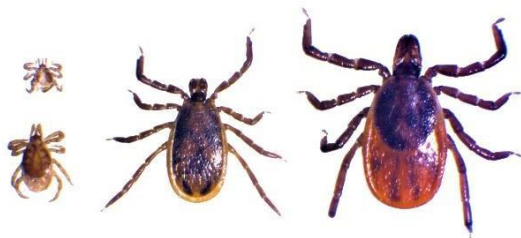
Figure 1. Life stages of Ixodes scapularis . Top left: Larva. Bottom left: Nymph. Center: Adult male. Right: Adult female. Ms. Jamie Cantoni, The Connecticut Agricultural Experiment Station.

The Active Tick Surveillance Program (ATSP) was established in Connecticut in the Spring of 2019 and continues to serve as an important public health resource. With an estimated 476,000 Lyme disease cases annually across the United States – along with at least 17 other tick-borne diseases currently recognized of significant medical concern – ticks, primarily the blacklegged tick (aka deer tick), Ixodes scapularis , are the most important arthropod vector harboring zoonotic pathogens that cause human disease. Monitoring evolving changes in tick populations and emerging new species in Connecticut is critical in the mitigation and reduction of tick-borne pathogens that influence thousands of Lyme disease and other tick-associated illnesses documented in our own state every year.