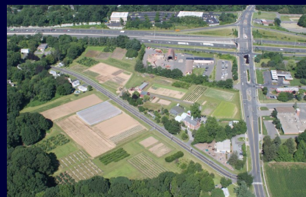
Valley Laboratory, Windsor

Valley Laboratory 153 Cook Hill Road Windsor, CT 06095-0248 Phone: 860-683-4977