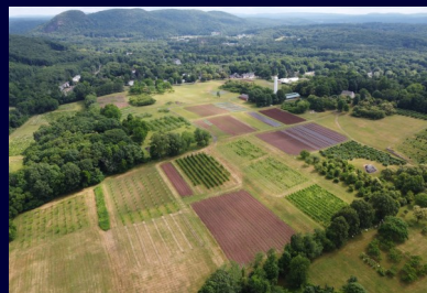
Lockwood Farm, Hamden

Lockwood Farm 890 Evergreen Avenue Hamden, CT 06518-2361 Phone: 203-974-8618