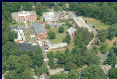
Main Laboratories, New Haven

Main Laboratories 123 Huntington Street New Haven, CT 06511-2016 Phone: 203-974-8500