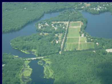
Griswold Research Center, Griswold

Griswold Research Center 190 Sheldon Road Griswold, CT 06351-3627 Phone: 860-376-0365