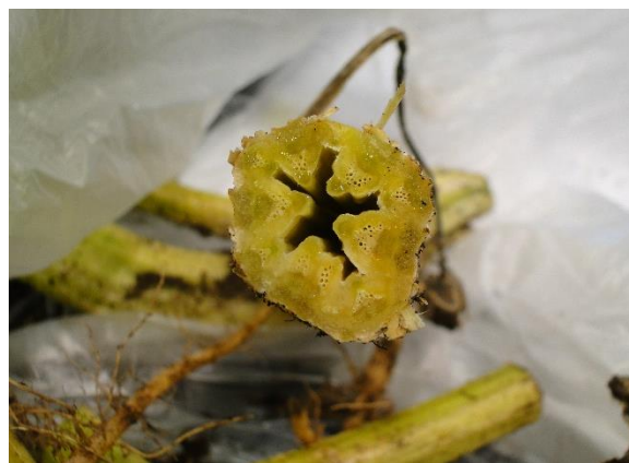
Figure 2. Water-soaking and discoloration of vascular tissues of a pumpkin stem.