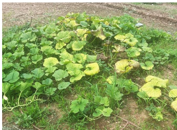
Figure 1. Chlorosis and necrosis of leaves, and collapse of a pumpkin plant.

die. Young, succulent plant tissues are more susceptible to the infection and develop symptoms more rapidly. On pumpkin plants, the initial symptom appears as chlorosis of leaves between veins and drooping of leaves. As the disease progresses, the affected leaf tissues become necrosis from the margin of leaves before the entire plant collapses (Figure 1). These symptoms normally go unnoticed until mid- or late-summer. Upon the bacteria enter vascular tissues, they destroy plant cells and block xylem vessels, which causes wilting of leaves and death of a runner or entire plant. Damaged stems tissues become water-soaked and discolored (Figure 2). When a diseased stem is cut through using a sharp knife and the cut ends are separated apart slowly, a thin bridge of a sticky substance between the ends can confirm the