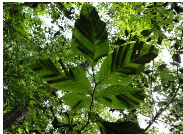
Figure 2. Dark green striping between veins on beech leaves.

Dark green striping between leaf veins is a characteristic symptom of this disease, which is especially noticeable when viewing upward into the canopy (Figure 2) or viewing against light (Figure 3). The symptom appears when leaves form in the spring. The initial symptoms are darkening and wrinkling of small portion of leaf tissues between veins (Figures 3 and 4). As disease progresses, the infected leaf tissues turn yellow, slightly raised, crinkly, and leathery (Figure 5). Heavily infected leaves are curled downward, shrunken, and are prematurely defoliated (Figure 6). Sapling and young trees are more susceptible to the disease and can die within three years after symptoms are observed, which can reduce the proportion of American beech in the affected forest areas. Symptoms of other