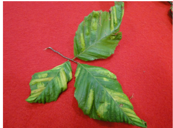
Figure 5. Yellow striping between veins on the upper surface of beech leaves.