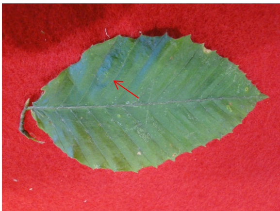
Figure 3. Wrinkling of leaf tissues between veins.