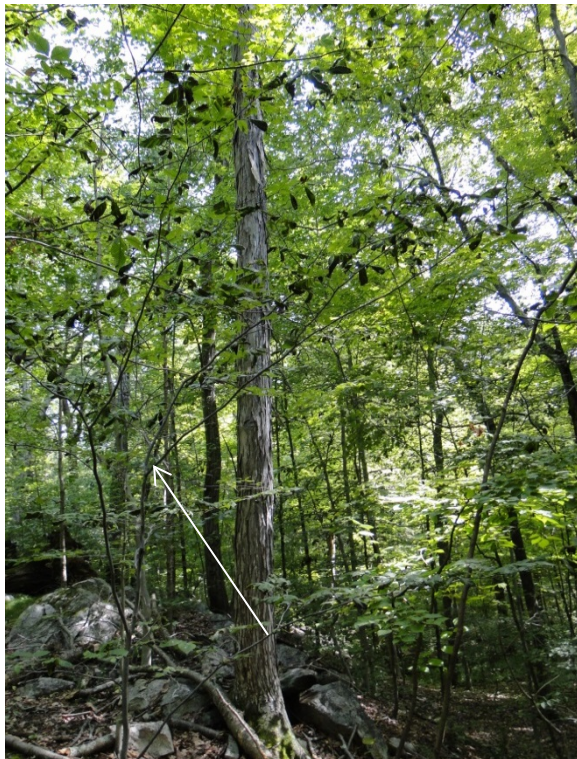
Figure 1. A beech sapling affected by beech leaf disease (arrow).

Beech leaf disease was first discovered in Ohio in 2012. It has since been found in Pennsylvania, New York, and Ontario, Canada in North America. In Connecticut, this disease was first detected in August 2019 (Figure 1). The disease has been observed mainly in forests, but also in landscaped areas. Beech leaf disease causes premature leaf drop and thin canopies, and also makes the trees more susceptible to other pests.