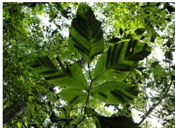
Figure 2. Dark green striping between veins on beech leaves.

Dark green striping between leaf veins is a characteristic symptom of this disease, which is especially noticeable when viewing upward into the canopy (Figure 2) or viewing against light (Figure 3). The symptom appears when leaves form in the spring. The initial symptoms are darkening and wrinkling of small portion of leaf tissues between veins (Figures 3 and 4). As disease progresses, the infected leaf tissues turn yellow, slightly raised, crinkly, and leathery (Figure 5). Heavily infected leaves are curled downward, shrunken, and are prematurely defoliated (Figure 6). Sapling and young trees are more susceptible to the disease and can die within three years after symptoms are observed, which can reduce the proportion of American beech in the affected forest areas. Symptoms of other