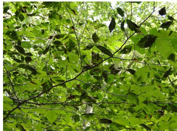
Figure 6. Curling and browning of leaves.