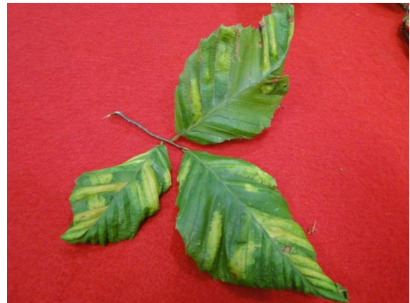
Figure 5. Yellow striping between veins on the upper surface of beech leaves.