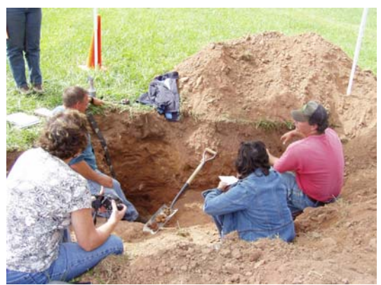
Presentation by NRCS