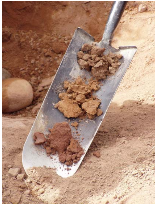
Sample of soils at Lockwood Farm