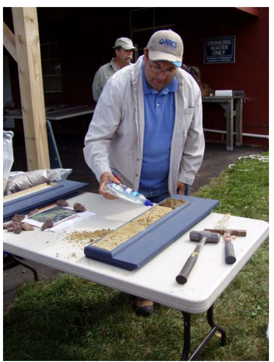
NRCS showing us how to make a soil monolith