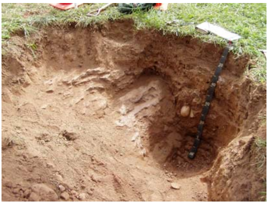
Sample pit at Lockwood Farm

On Thursday, September 10<sup>th</sup>, an afternoon workshop was presented to learn more about the soil types at Lockwood Farm and how to build a soil monolith. Representatives from the Natural Resource Conservation Service (NRCS) presented this demonstration. Some of the attendees were The Connecticut Agricultural Experiment Station (CAES) staff members, a Yale faculty member, a Connecticut Department of Environmental Protection (DEP) representative, and students from Trinity College. The digging of the soil pits began on Wednesday, September, 9<sup>th</sup>, and the monoliths were prepared during the workshop on the 10<sup>th</sup>. We worked with two soil series for the workshop Yalesville (fine sandy loam) from Lockwood Farm and the Windsor (loamy sand) soil series from a farm in East Windsor, which is also the "State Soil" for Connecticut. CAES was able to retain these two soil monoliths for our staff to use in presentations and displays.