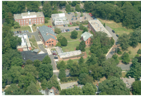
Main Laboratories, New Haven