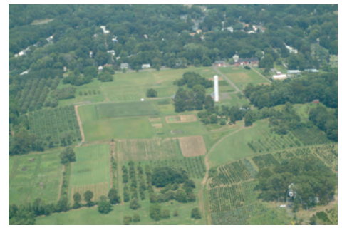
Lockwood Farm, Hamden