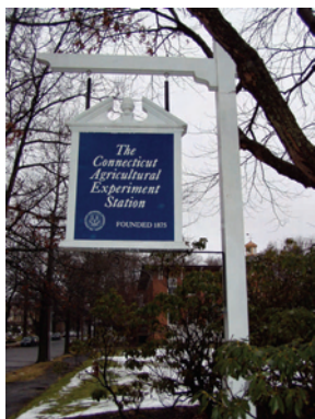
Entrance to The Connecticut Agricultural Experiment Station in New Haven on Huntington Street