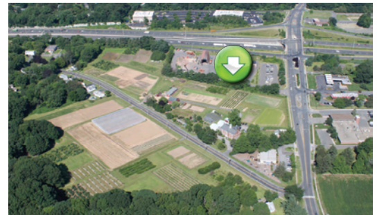
Valley Laboratory, Windsor