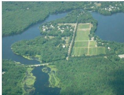
Griswold Research Center, Griswold