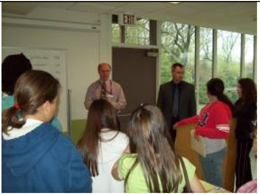
Students discuss their findings during a CAES workshop.