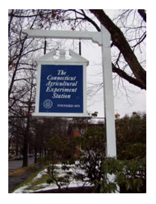
Entrance to The Connecticut Agricultural Experiment Station in New Haven on Huntington Street