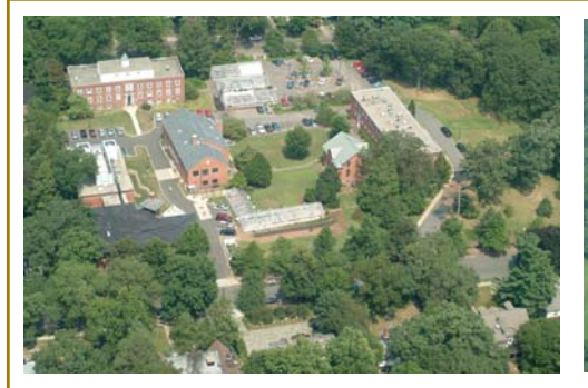
Main Laboratories, New Haven