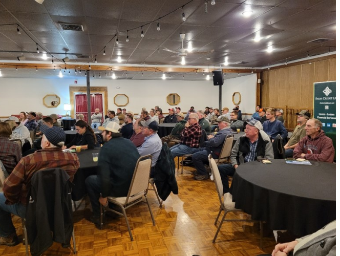
The Connecticut Agricultural Experiment Station | Station News | Volume 14 Issue 4 | April 2024