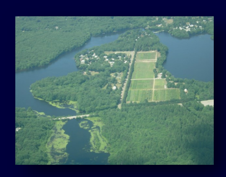
Griswold Research Center, Griswold