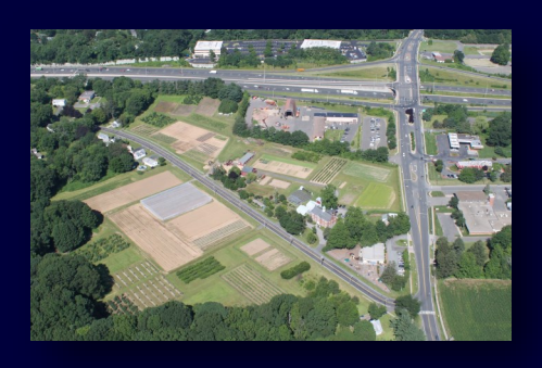
Valley Laboratory, Windsor