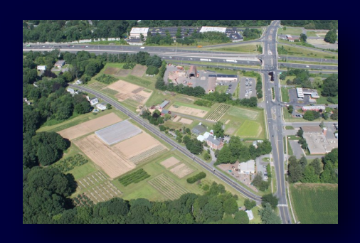
Valley Laboratory, Windsor