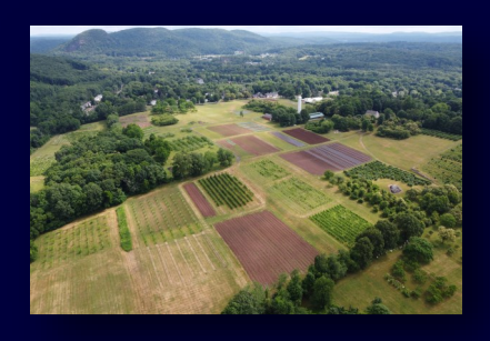
Lockwood Farm, Hamden