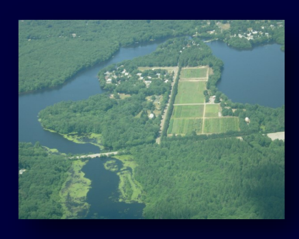
Griswold Research Center, Griswold