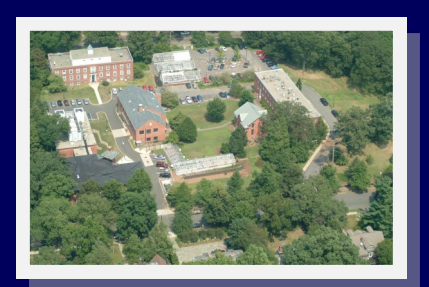
Main Laboratories, New Haven