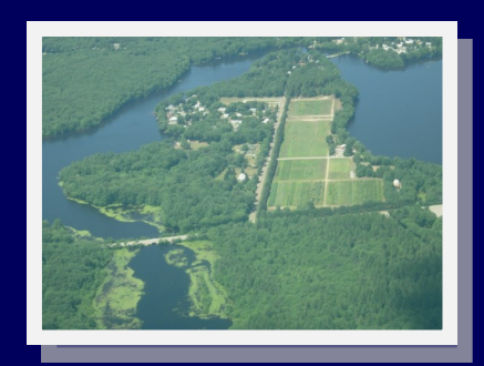
Griswold Research Center, Griswold