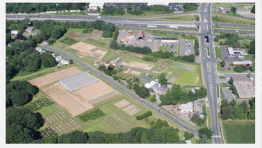
Griswold Research Center, Griswold