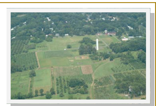
Lockwood Farm, Hamden