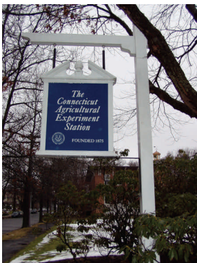
Entrance to The Connecticut Agricultural Experiment Station in New Haven on Huntington Street