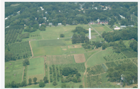
Lockwood Farm, Hamden