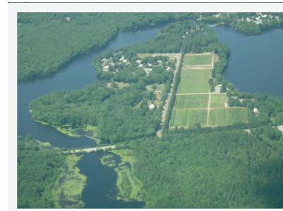
Griswold Research Center, Griswold