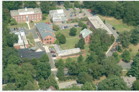
Main Laboratories, New Haven