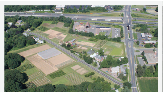
Valley Laboratory, Windsor