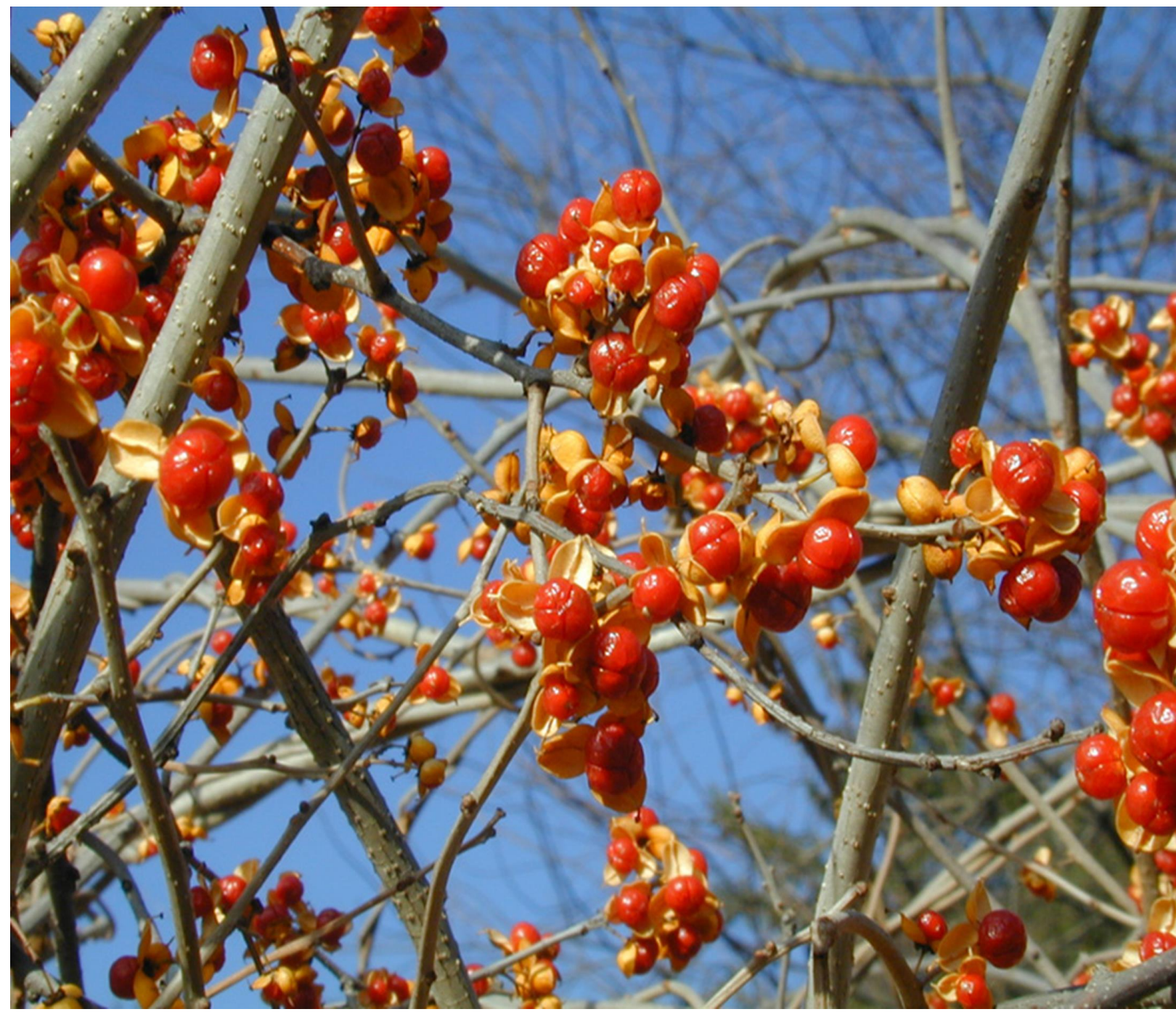
Oriental Bittersweet, Celastrus orbiculatus