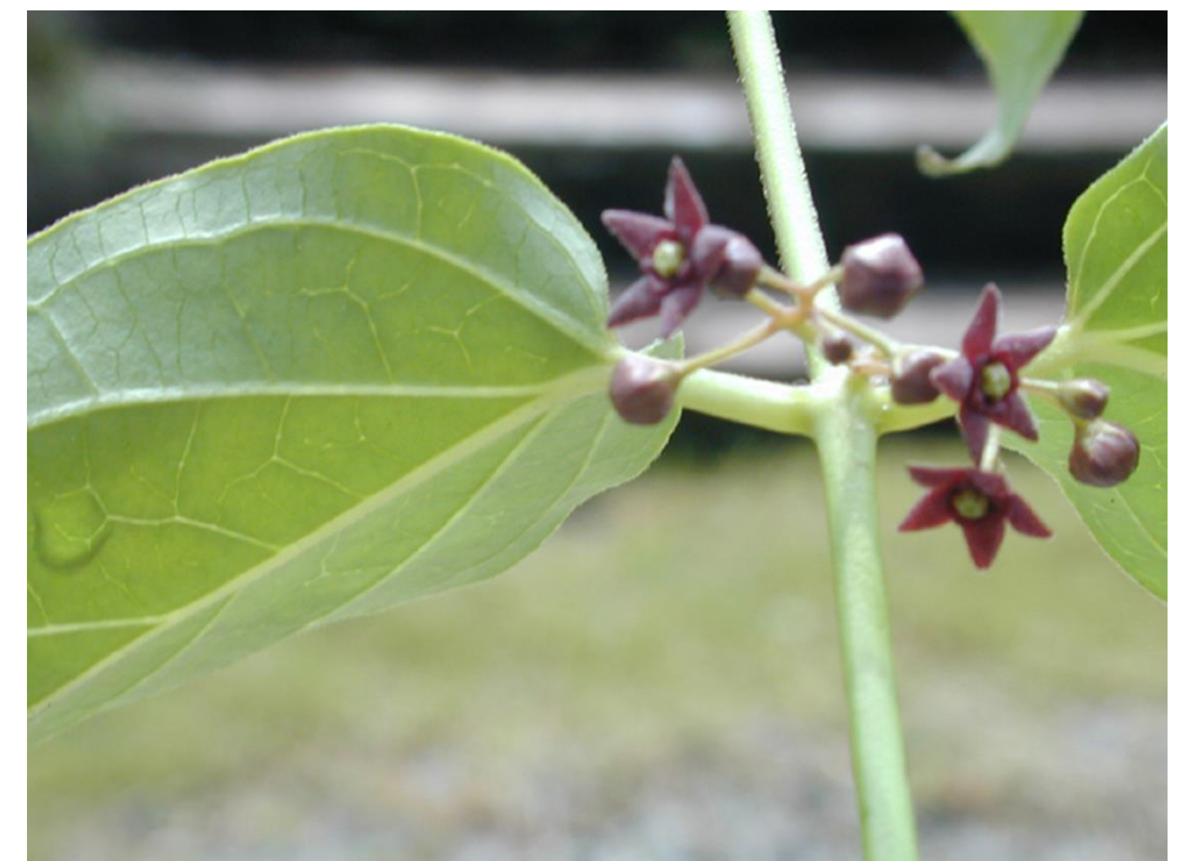
Black Swallow-wort, Cynanchum louiseae