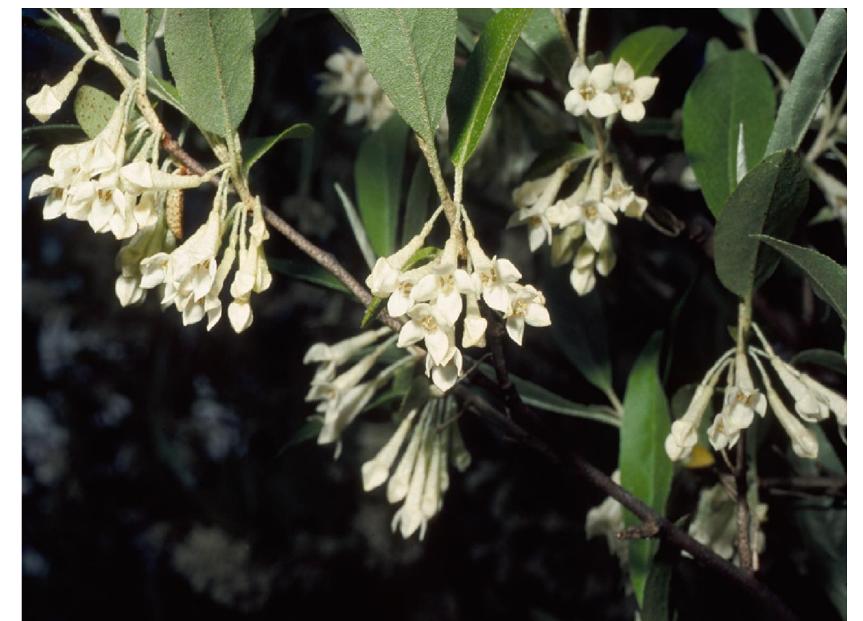
Autumn Olive, Elaeagnus umbellata