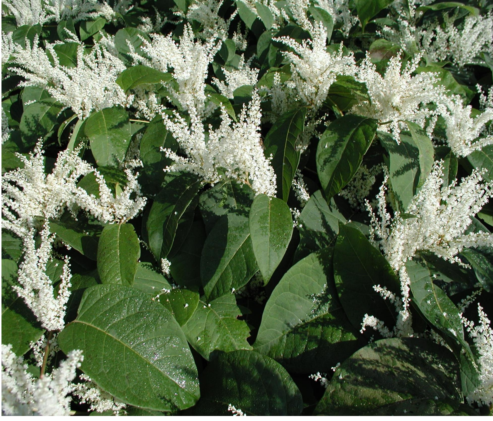
Japanese Knotweed, Polygonum cuspidatum