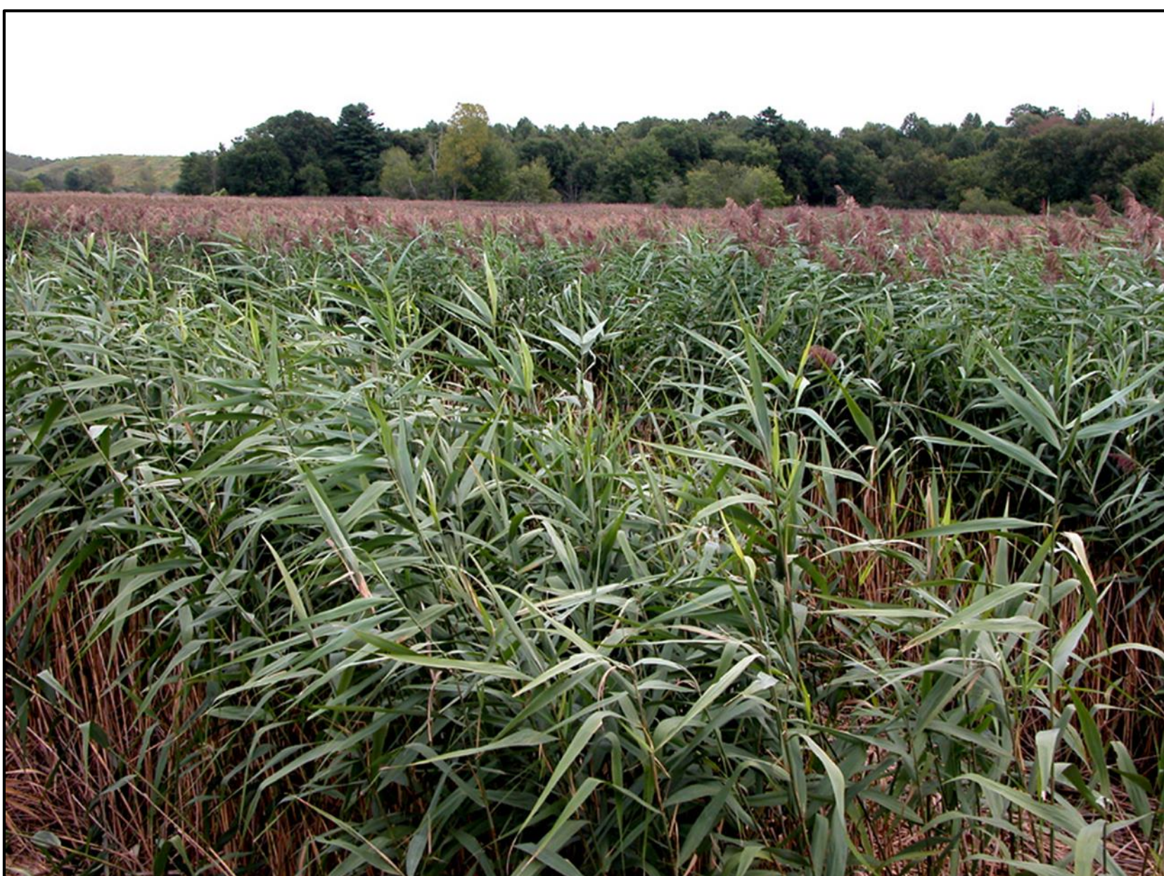
Common Reed, Phragmites australis