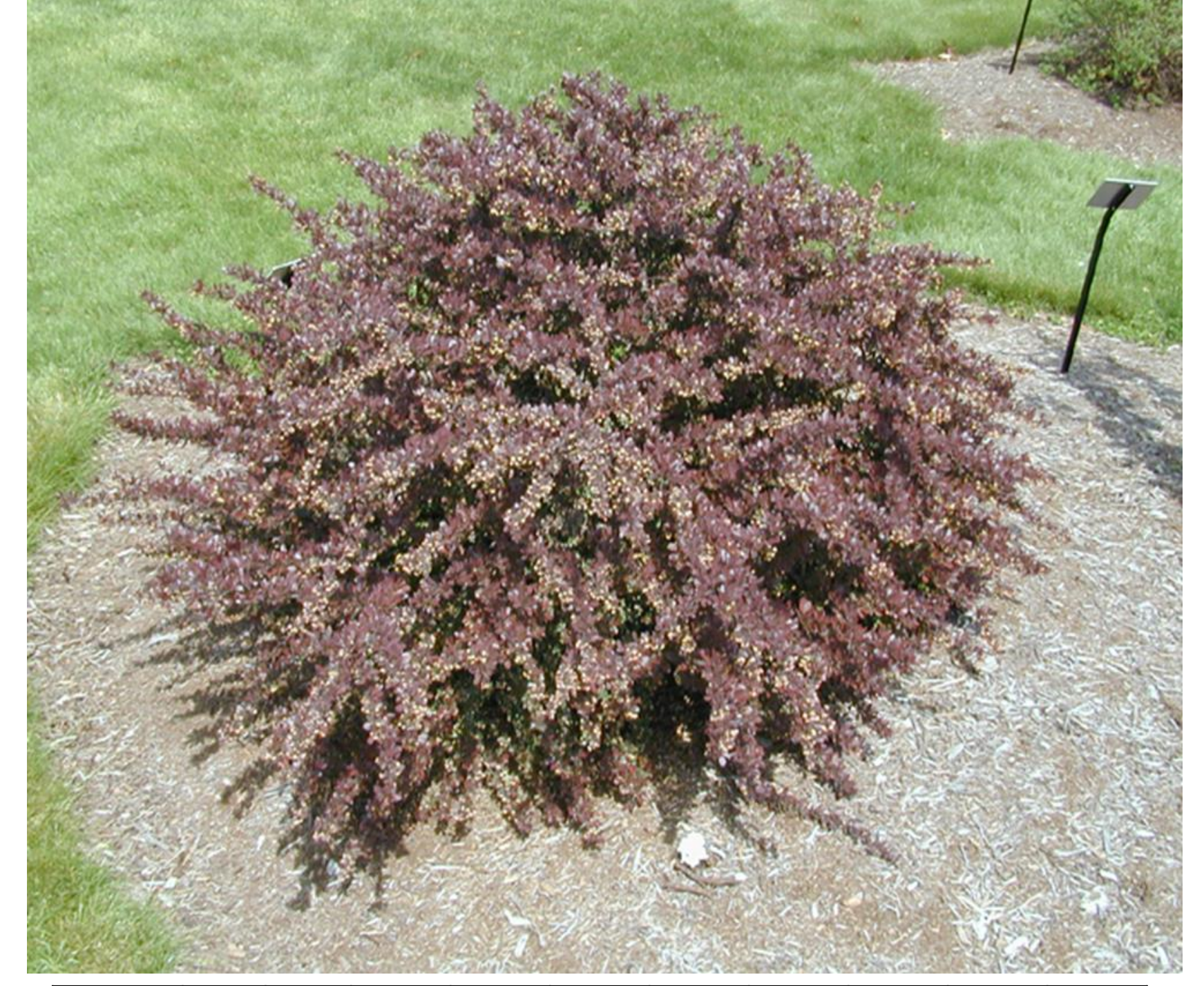
Japanese Barberry, Berberis thunbergii