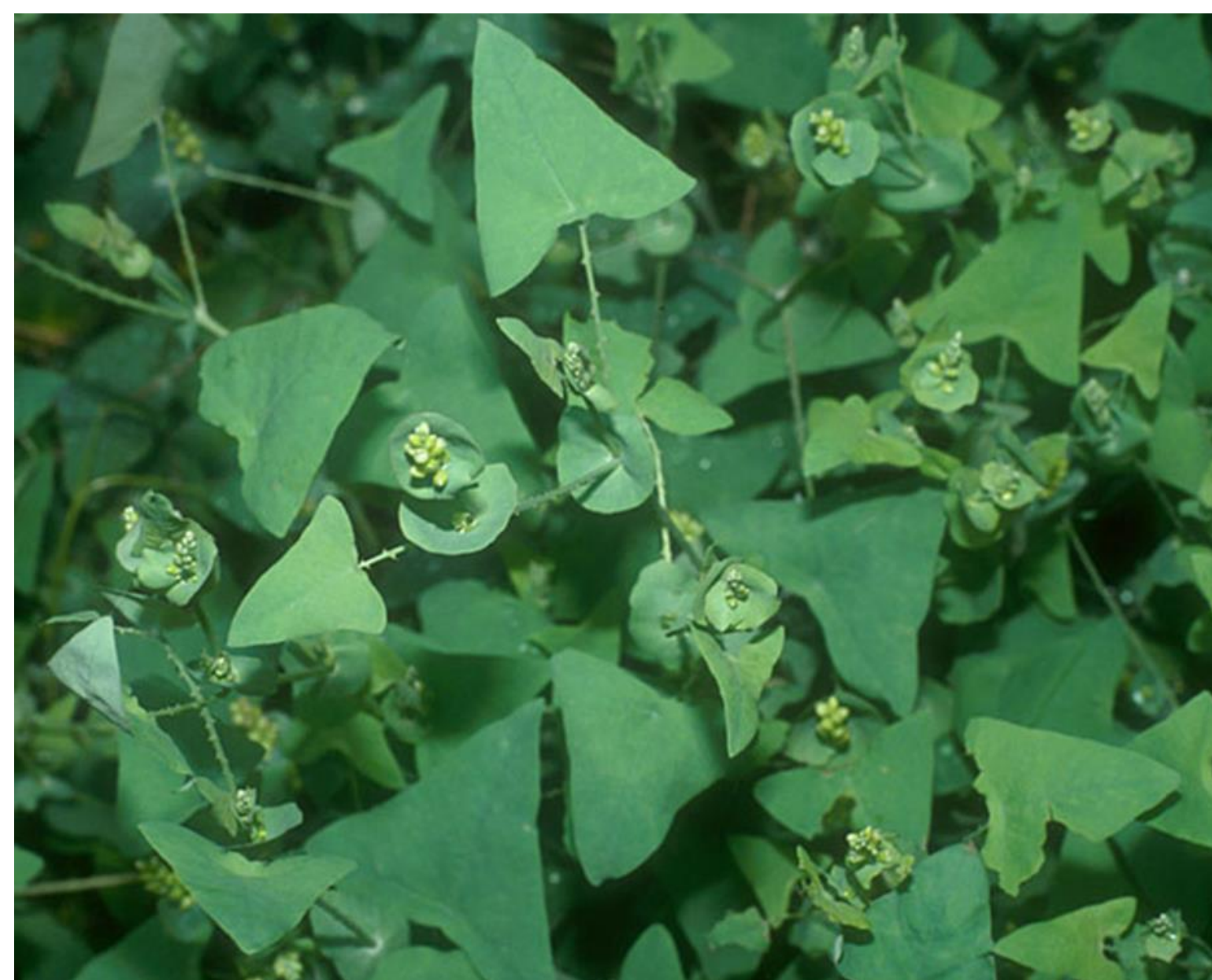
Mile-a-Minute, Persicaria perfoliata