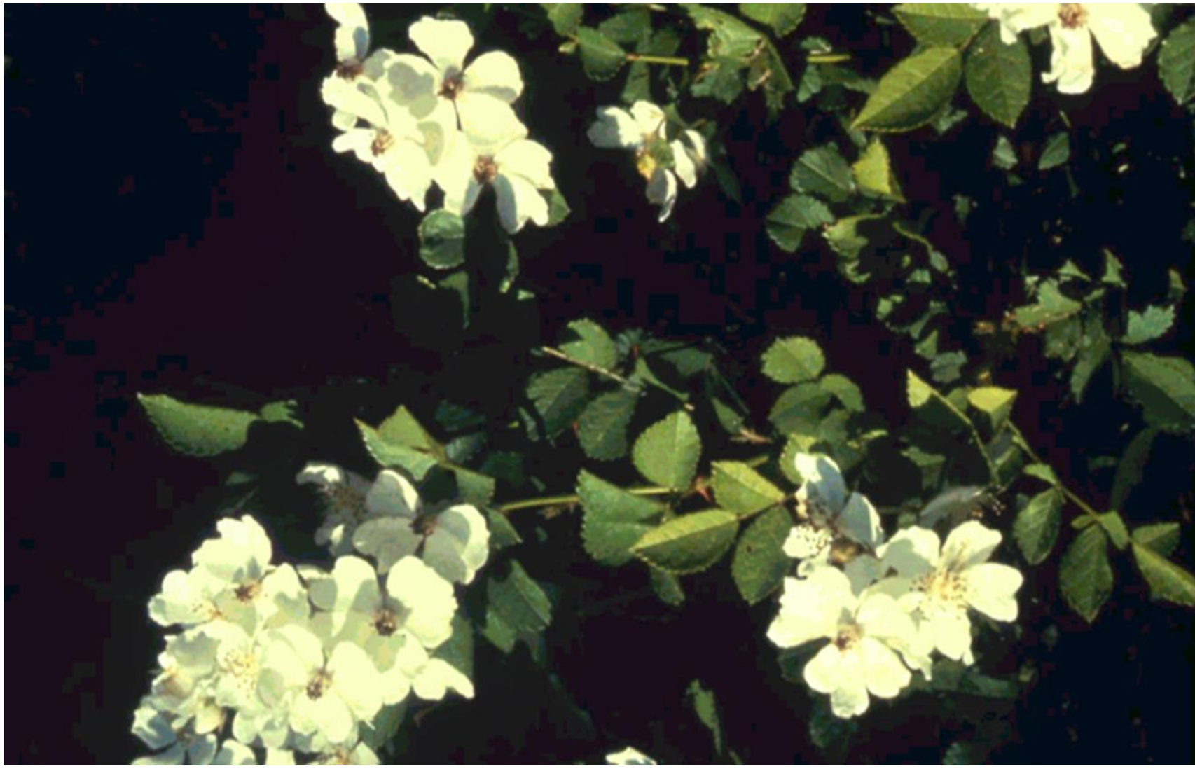
Multiflora Rose, Rosa multiflora