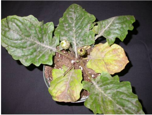
Figure 2. Powdery mildew on gerbera daisy.

premature leaf coloration and drop, slowed or stunted growth, and leaf rolling. In rare, but extreme situations, heavy infections cause plant death.