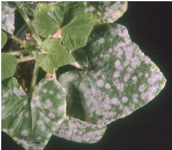
Figure 4. Powdery mildew colonies on cucumber transplant.

Threadlike strands of the fungus (hyphae) then grow over the surface of the infected plant part and eventually produce more conidiophores and conidia. The time between when conidia land to when new conidia are produced can be as short as 72 hrs but is more commonly 5-7 days. Powdery mildew conidia are unique since unlike most fungal spores, they do not require free moisture on plant surfaces in order to infect.