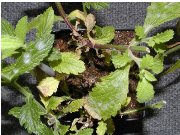
Figure 3. Powdery mildew on verbena.

Although diagnosis of powdery mildew is not difficult, symptoms often escape early detection. When plants are not periodically monitored, symptoms that develop on lower or middle leaves aren't discovered until they are sporulating. This explains reports of sudden "explosions" of disease when the percentage of infected leaves increases from 10% to 70% in one week.