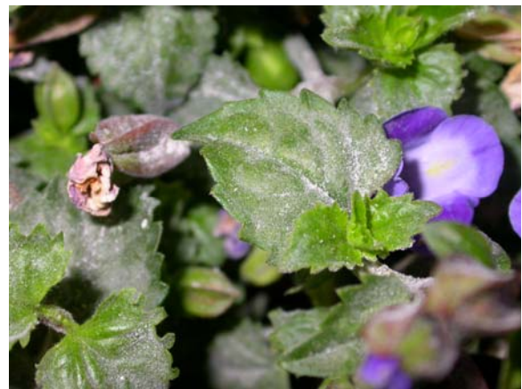
Figure 1. Powdery mildew on torenia.

white to sparse and gray. Powdery mildew fungi usually attack young developing shoots, foliage, stems, and flowers but can also colonize mature tissues. Symptoms often first appear on the upper surface of leaves but can also develop on the lower surfaces. All aboveground parts of plants can be infected. Early symptoms are variable and can be subtle, appearing as irregular chlorotic or purple areas or as necrotic lesions. These symptoms are followed by the typical white, powdery appearance (Figures 1, 2, 3, and 4).