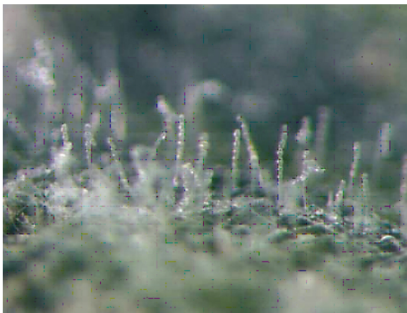
Figure 5. Chains of powdery mildew conidia growing the surface of a cucumber leaf.

In greenhouses, powdery mildews usually survive between crops as hyphae or fungal strands in living crop plants or in weedy hosts. Under certain circumstances, some powdery mildew fungi produce small, black, pepper-like resting structures called chasmothecia (formerly cleistothecia) (Figure 6). These structures allow the fungus to survive in the absence of a suitable host. However, the role of these resistant structures is probably insignificant in greenhouse situations since continuous cropping usually provides a constant source of living hosts.