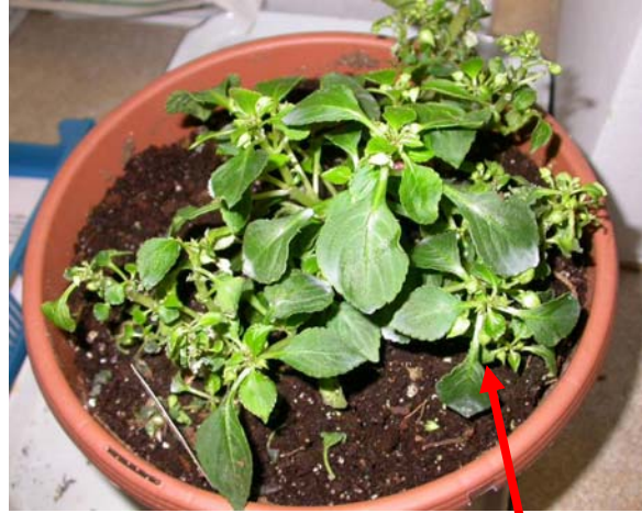
Figure 7. Impatiens with downy mildew. Note stunted plants and leaves that curl downwards.

Downy mildews have become increasingly problematic in the horticultural industry and are currently causing serious losses in many floricultural crops. Key factors contributing to the extent of these losses are delayed recognition and misidentification. Symptoms first appear as subtle pale-yellow or light green areas on upper leaf surfaces. Infected leaves can also curl downward (Figure 7). On some hosts, downy mildew can result in irregular, angular lesions that can easily be confused with damage from foliar nematodes. In other cases, flower buds fail to form. Systemic symptoms can include stunting, leaf distortion and epinasty, shortened internodes, and decreases in the quantity and quality of flowers that are produced. Diagnostic symptoms gradually develop on the undersurface of the leaf as the pathogen grows out of the infected leaf. This growth appears as a fuzzy, tan-gray-purple-brown mass (Figure 8). Symptoms often go unnoticed until leaves brown, shrivel, and drop.