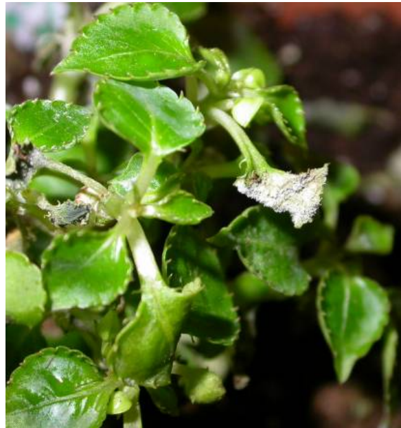
Figure 8. Undersurface of impatiens leaf with abundant downy mildew sporulation (arrow).