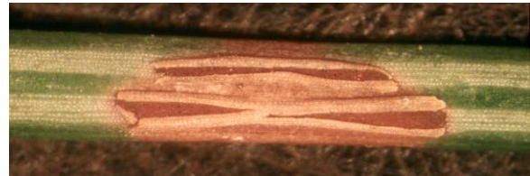
Figure 4. Close-up of longitudinal splits on the underside of a symptomatic needle. The orange fungal mass will develop into spores that incite new infections.

When the spores land on immature needles they germinate, penetrate the cuticle, and begin to grow within the needle. Although the fungus has already infected the needle, no obvious external symptoms are evident until considerably later, usually by fall or winter.