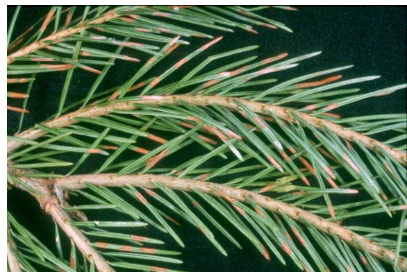
Figure 1. Diagnostic brown banding pattern of infected needles. Symptoms become visible in late winter and early spring.

A distinctive diagnostic symptom is the sharp border between the healthy green tissue and the infected brown tissue (Figure 1). Discolored needles are most conspicuous in early spring.