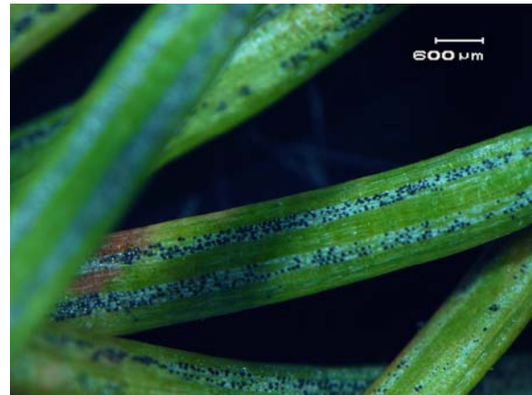
Figure 5. Black fruiting bodies visible in the white rows of stomates.

Swiss needlecast is caused by the fungus Phaeocryptopus gaumanni . Symptoms are usually evident in late winter and early spring and appear on one- or two-year-old needles. Affected needles appear yellow or mottled and gradually turn brown. They often have a “dirty” appearance. When the undersides of the needles are examined with a hand lens, two bands of round, black fruiting bodies can be seen on either side of the midrib (Figure 5). With the naked eye, these bands look like “dirt.” The fruiting bodies are structures of the fungus that grow out of the stomates (Figure 6).