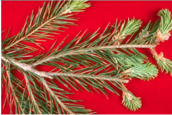
Figure 2. One-year-old needles infected with Rhabdocline spp. provide the inoculum to infect the flush of new, susceptible needles (light green).

Symptoms are often most severe in the lower portion of the tree where air circulation is poor. Although some of the heavily infected needles drop before or during budbreak, most will persist for several months.