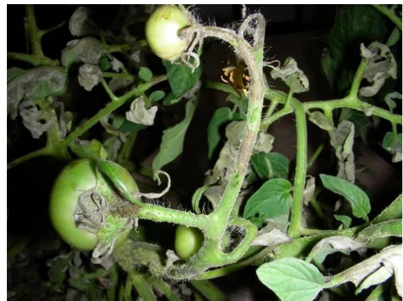
Figure 5. Late blight lesions on fruit calyx and stem tissues.

Symptoms commonly develop on leaves, but can occur on petioles, stems, and calyx tissues (Figure 5). After rainfall or heavy dew, white growth of the pathogen is visible on infected stem tissues or on the top or bottom leaf surfaces (Figure 6). When these lesions dry out, the white growth disappears and lesions may appear lime-green or ash-gray in color. Symptoms rapidly develop on leaflets, leaves, and stems when weather is favorable for infection and spread, so plants can be killed in several days.