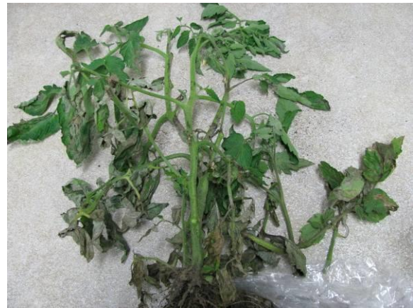
Figure 1. General symptoms of collapse on tomato associated with late blight.

They are readily visible to the naked eye and appear as water-soaked, olive-brown to black blotches or lesions on leaves and stems. Stem lesions are dark brown, dry, and superficial. They can appear as small spots or can be several inches long (Figure 2).