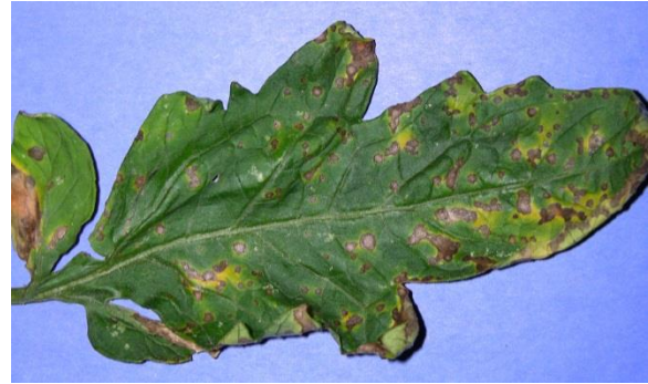
Figure 12. Symptoms of Septoria leaf spot of tomato.

Symptoms of Septoria leaf spot usually develop on lower leaves first and appear as small, water-soaked, circular spots 1/16 to 1/8" in diameter that gradually turn gray to tan and have dark brown margins (Figure 12). Infected leaves often turn yellow. In addition, dark brown, pimple-like fruiting bodies of the fungus are readily visible in the tan centers of the spots. Once there are many lesions on the leaflets, the lesions coalesce and form large brown blotches that can be identified as late blight or early blight (Figure 13).