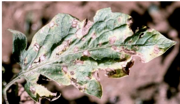
Figure 11. Symptoms of early blight caused by Alternaria solani .

Symptoms of late blight are sometimes confused with Septoria leaf spot of tomato caused by Septoria lycopersici , and early blight of tomato , caused by Alternaria solani . Both of these fungal diseases are more common in Connecticut than late blight and can be differentiated by microscopic identification and by macroscopic features. Early blight symptoms can develop on any aboveground plant tissues. Initial symptoms are dark brown to black, dead spots that range from a pinpoint to 1/2" in diameter. As the spots enlarge, diagnostic concentric rings may form as a result of irregular growth patterns by the organism in the leaf tissue. This gives the lesion a characteristic "target-spot" or "bull's eye" appearance (Figure 11).