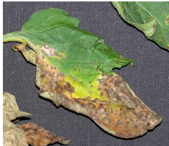
Figure 13. As the spots age, they sometimes enlarge and often coalesce to form brown blotches on the leaflets.