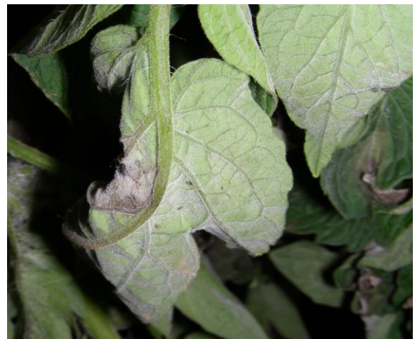
Figure 6. White sporulation of the pathogen on the undersurface of infected leaflets.