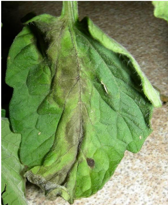
Figure 4. Typical olive-brown late blight lesions on tomato leaflet.

When many lesions develop, they coalesce into large, brown areas. These infected tissues dry out and shrivel.