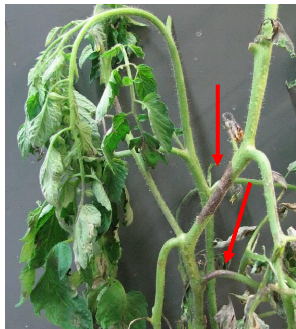
Figure 2. Dry, brown lesions on stems (arrows).

On leaflets and leaves, late blight lesions vary in size from ½ to ¾ inch or larger. Lesions are water-soaked, olive brown, and