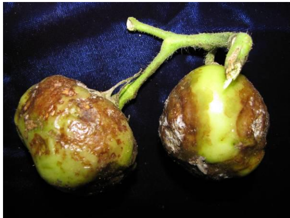
Figure 7. Green tomato fruit with symptoms of late blight.

develop on the stem end or on any part of the fruit. They appear as dark brown, sunken lesions (Figure 7). The lesions rapidly expand, and eventually surround the entire tomato fruit (Figure 8). This is often followed by secondary soft rot and rapid disintegration of the fruit.