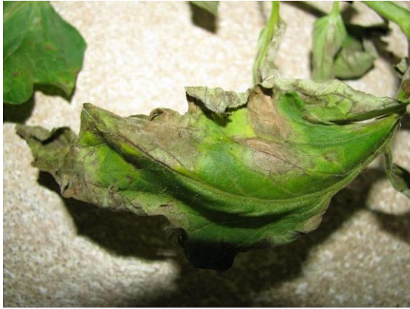
Figure 3. Early symptoms of late blight appear as brown, water-soaked lesions with yellow margins.

sometimes have yellow margins (Figures 3 and 4).