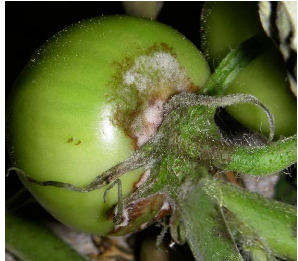
Figure 9. White sporulation of the pathogen on the surface of an infected fruit.

Potato tubers are infected in the field when sporangia are washed from the foliage down into the soil. Infections generally begin in cracks, eyes, or lenticels of the tubers.