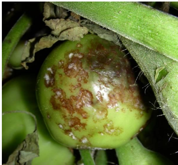
Figure 8. Dark brown, sunken late blight lesions on green fruit.

White, fluffy growth of the pathogen develops on infected fruit during periods of high humidity or moisture (Figure 9). This growth comprises thousands of sporangia of P. infestans (Figure 10).